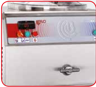
Slanting front panel with rounded anti-drip upper edge. Thermo-regulator with "sensible touch" display