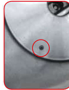
Probe in direct contact with the mix