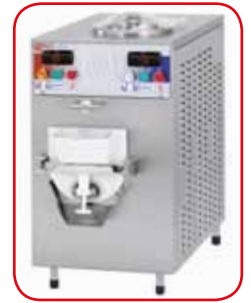
Table top model