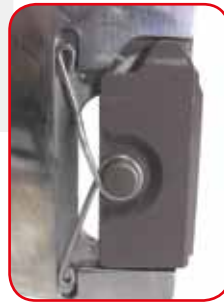
Detail: interchangeable metal scraper