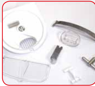
Manually dismantlable door for a perfect and fast cleaning