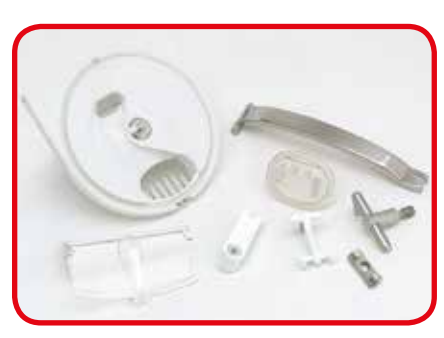
Complementary door is disassembled without the use of tools, for a perfect hygiene