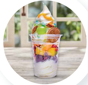
FRUIT-TASTIC Frozen Yogurt