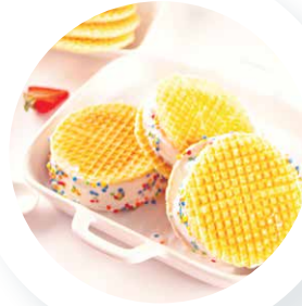
Frozen Yogurt WAFFLE BITES