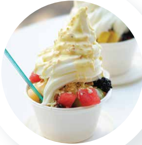
LEMON CREAM & TOASTED ALMOND TOPPING WITH FRUIT Frozen Yogurt