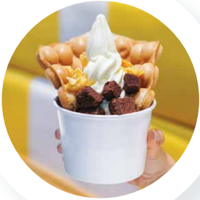
BROWNIE BITE DELUXE Frozen Yogurt