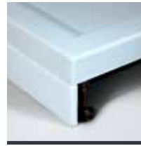
Adjustable legs & tray panel kit