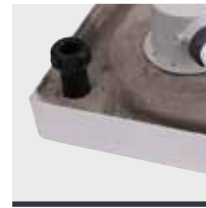
Graduated adjustable leg system