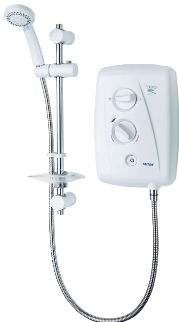
White/Chrome Eco Model