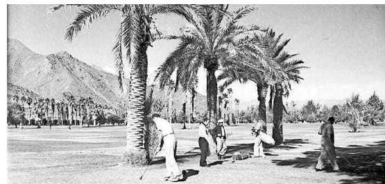
Date palms were added as ornament to the landscape of the O'Donnell Golf Club, as seen in 1951.