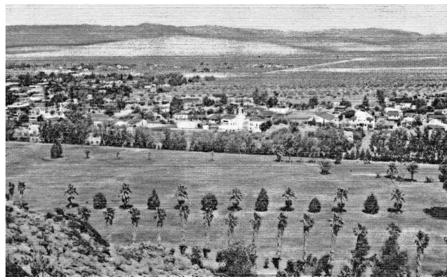
The image on this postcard overlooks the O'Donnell Golf Course looking east.