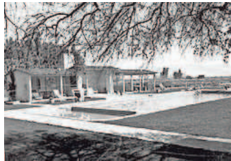
The Deep Well Ranch pool is shown in the 1930s.