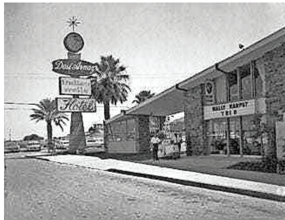
Each room had its own air conditioner.