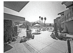
Private patios overlooked the 70-foot swimming pool.

Club of Palm Springs was the first good cause that was benefited: