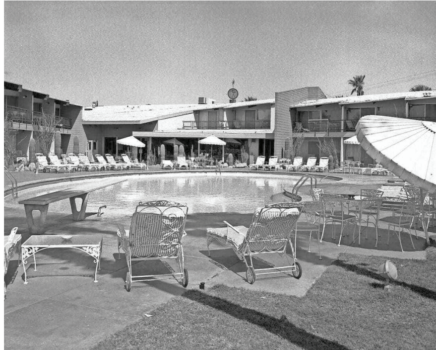
Desi Arnaz' Western Hills Hotel was luxurious with "every thought given to the comfort and enjoyment of the guests."