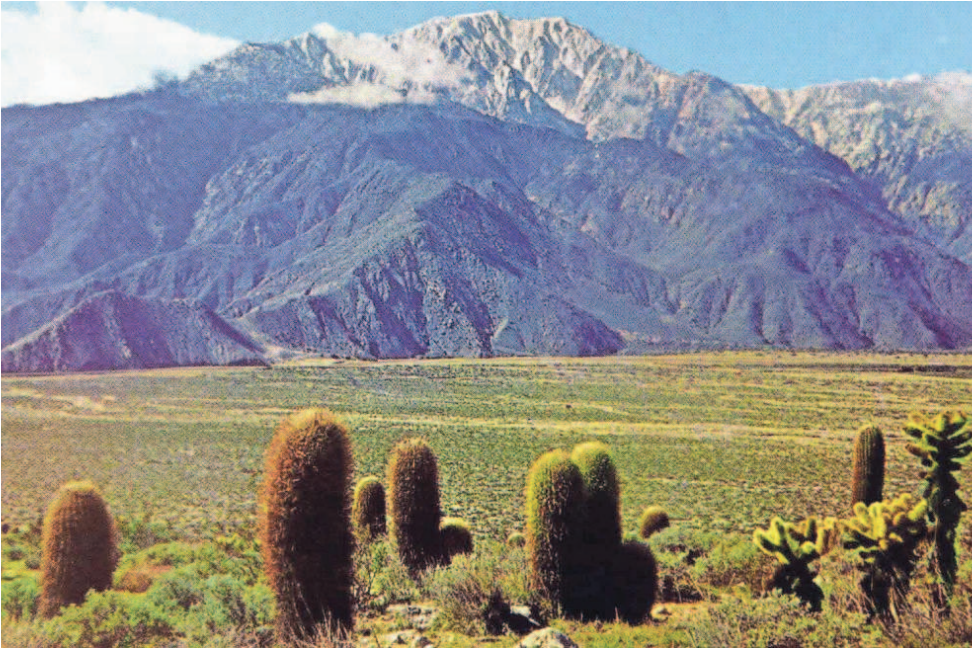
Devil's Garden offers a view of Mt. San Jacinto.