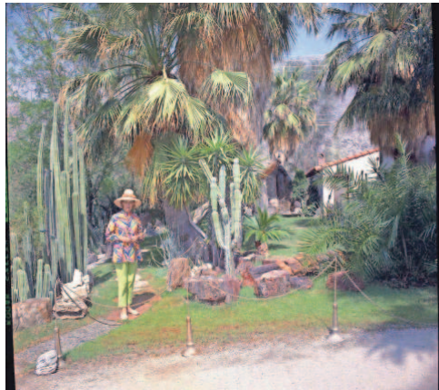
Pat Moorten stands in the Moorten Botanical Garden.

An introduction to a 'sport' which demands no expensive costing, which is easier on the temper than golf or tennis, which can be held to a minimum of expense and effort by the introduction of native drought-resistant plants, or can develop into a purse-taxing luxury, and muscle-developing hobby if you become an addict."