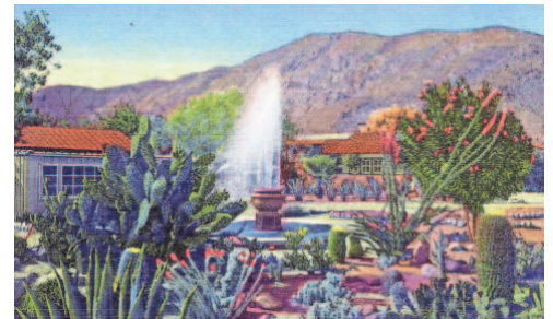
The Palm Springs Hotel features a large cactus garden.