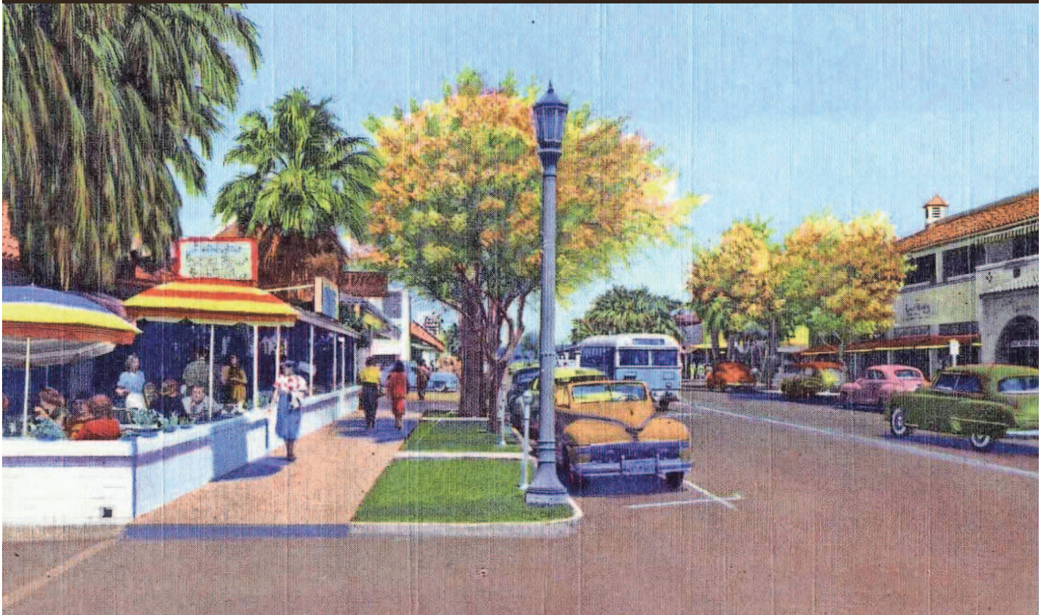
Village Coffee Shop at the Desert Inn in 1946.