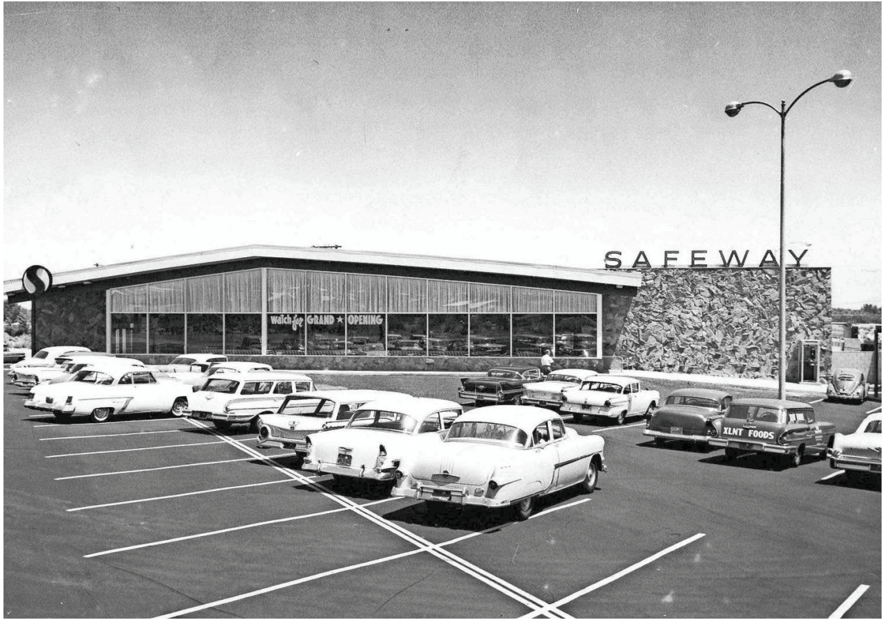
Safeway Market in Palm Springs in 1955.