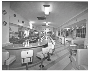
The interior of Louise's Pantry in the 1950s.

When not dining out, locals had a variety of shops from which to choose. Bakeries, ice cream parlors, liquor stores, butcher shops and sweet shops where delicacies of all sorts were easily had. Such abundance was only interrupted in the 1940s by wartime rations.