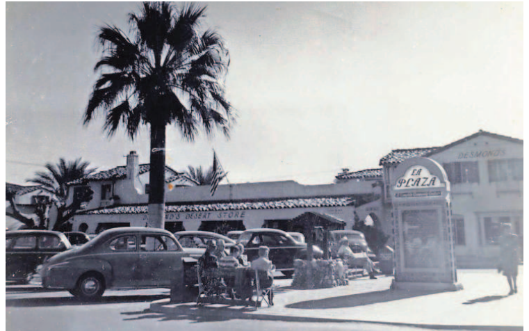
La Plaza (140 S. Palm Canyon Drive), c. 1946.