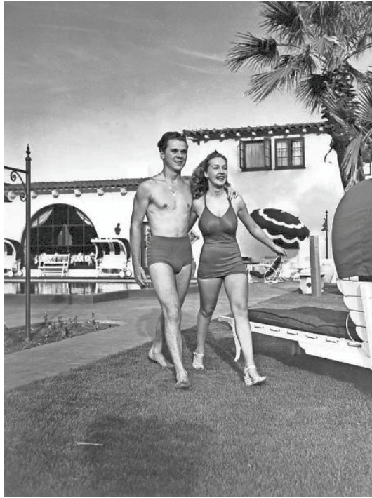
Jackie Cooper, Bonita Granville at El Mirador c. 1946.