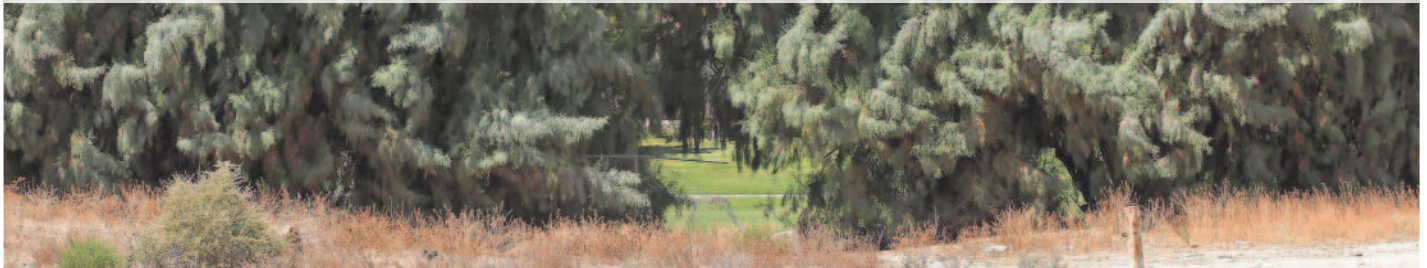
Tamarisk trees separate the Crossley Tract from the Tahquitz Creek Golf Course.