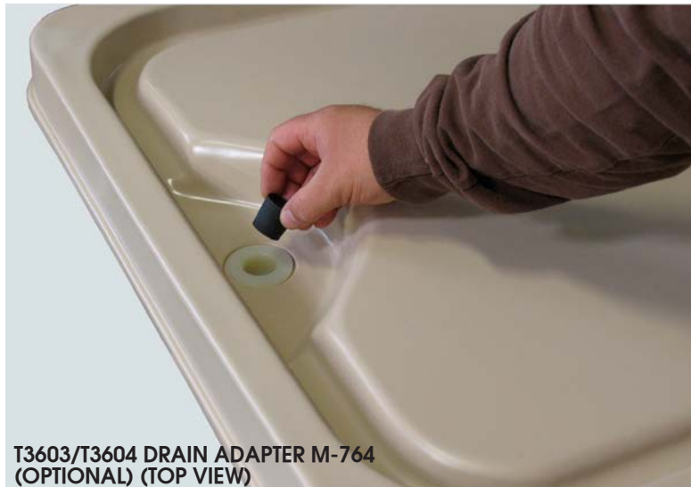
T3603/T3604 DRAIN ADAPTER M-764 (OPTIONAL) (TOP VIEW)