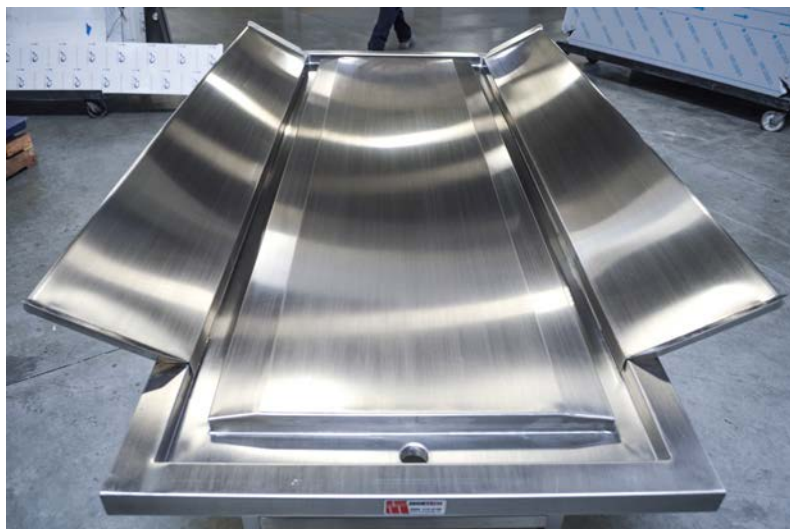
T3615 SPLASH BOARD (OPTIONAL)

TRAY PLUGS COME STANDARD WITH TRAYS. DRAIN ADAPTER (OPTIONAL) CAN BE ADDED TO A VARIETY OF TRAYS TO ASSIST IN THE COLLECTION OF WASTE MATERIAL