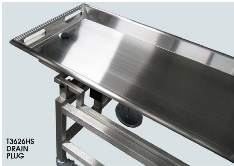
T3626HS DRAIN PLUG