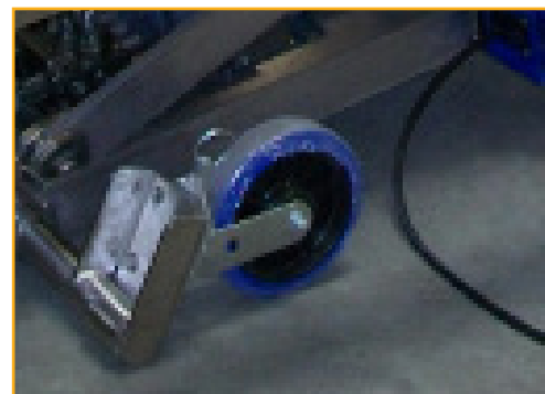
VARIABLE FRONT AND REAR WHEEL TILT