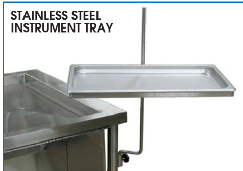
STAINLESS STEEL INSTRUMENT TRAY

Units are fabricated entirely of stainless steel. They feature a locking knob at the pole base and at the rear of the instrument tray which allows the pole to be locked in a variety of positions. The pole is designed to be placed at any corner of the table. All dissection tables come equipped with support sockets to accept the instrument tray pole. The instrument tray is removable to carry instrument to different location and for easy cleaning.