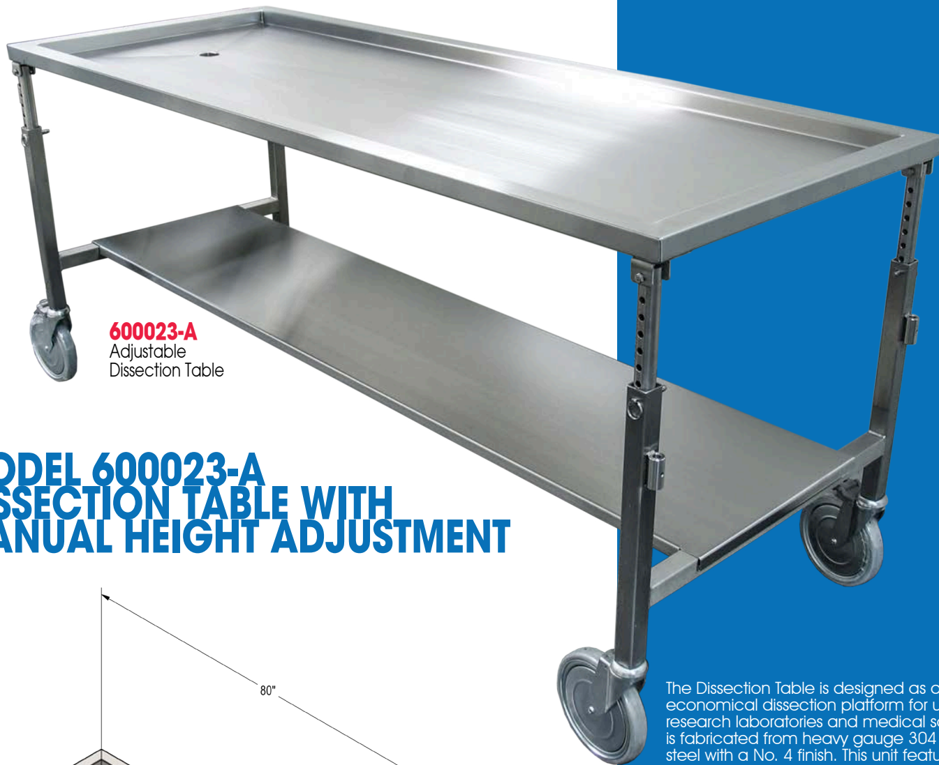
600023-A Adjustable Dissection Table