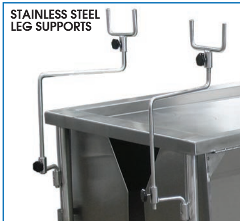
STAINLESS STEEL LEG SUPPORTS

Units are fabricated entirely of stainless steel. The "U" shaped leg supports can be swiveled. They feature a locking knob at the pole base to hold the support pole in position. The pole is designed to be placed at any corner of the table. All dissection tables come equipped with support sockets to accept the leg support pole.