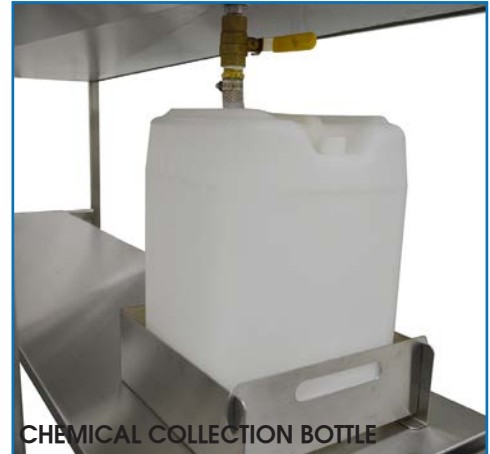
CHEMICAL COLLECTION BOTTLE

5 Gallon chemical resistant bottle held in place with stainless steel bottle holder. Also features a quick release hose for easy replacement.