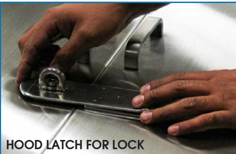
HOOD LATCH FOR LOCK

Stainless steel hinge latch lock mechanism can be provided for added security as well as prevention of accidents.