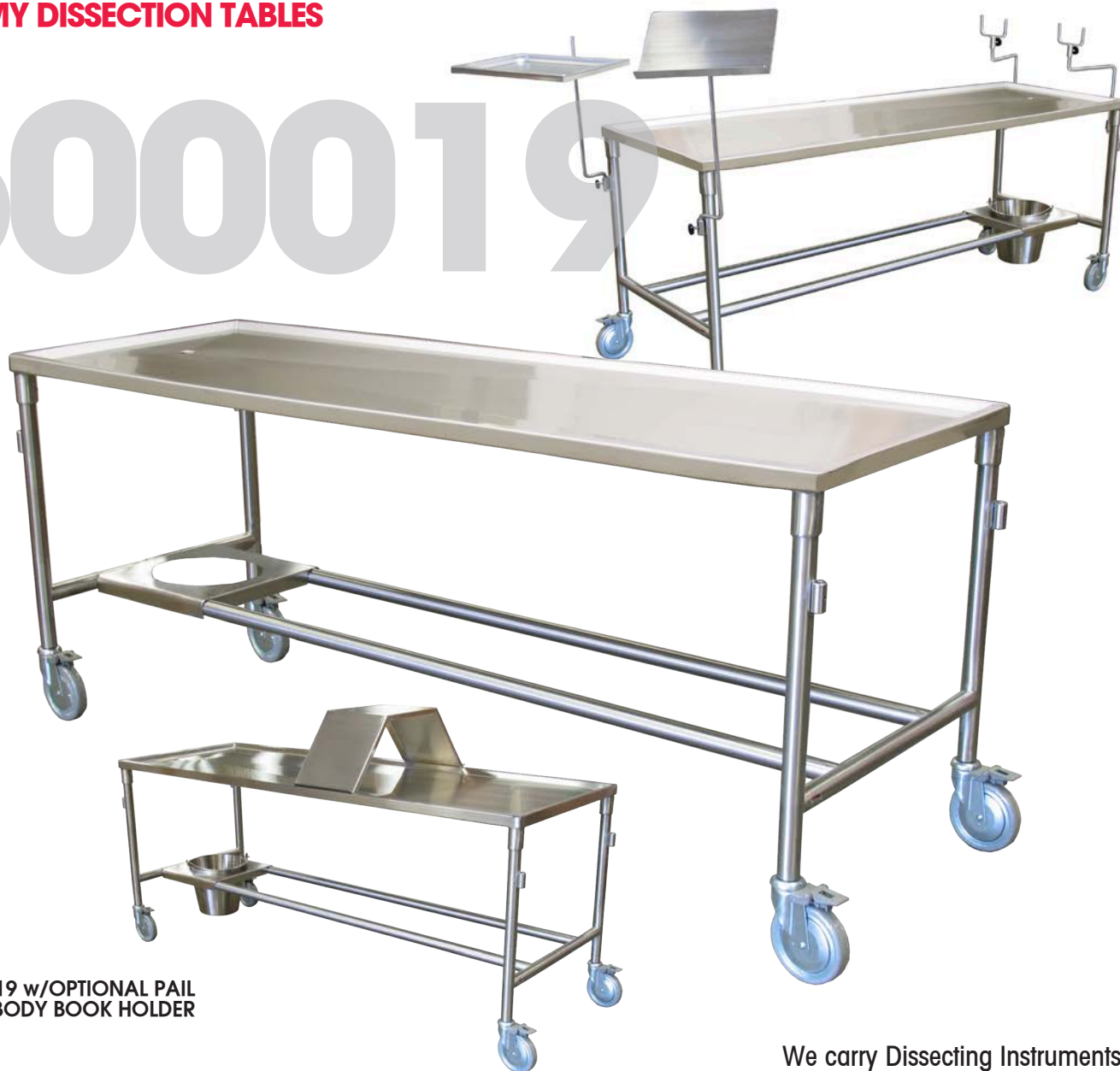
MODEL 600019 w/OPTIONAL PAIL & OVER THE BODY BOOK HOLDER

The Standard Dissection Platform is designed as an economical dissection platform for use in research laboratories and medical schools. It is fabricated from heavy gauge 304 stainless steel with a No. 4 finish