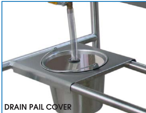
DRAIN PAIL COVER

Specially fitted cover to contain waste and debris. Allows drain hose assembly and ball valve to connect via tubing directly to the drain pail.