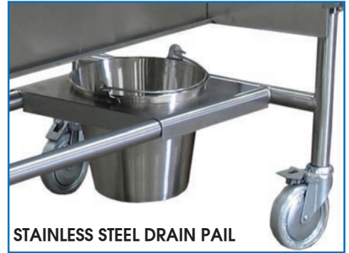
STAINLESS STEEL DRAIN PAIL

LW251 - 11.75 in./30 cm. D. x 10.125 in./23 cm. H, 16 L. capacity.