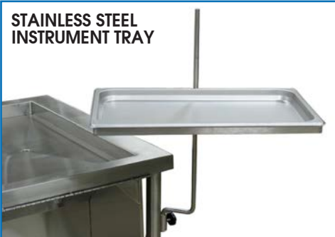
STAINLESS STEEL INSTRUMENT TRAY

Units are fabricated entirely of stainless steel. They feature a locking knob at the pole base and at the rear of the instrument tray which allows the pole to be locked in a variety of positions. The pole is designed to be placed at any corner of the table. All dissection tables come equipped with support sockets to accept the instrument tray pole. The instrument tray is removable to carry instrument to different location and for easy cleaning.