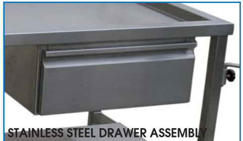
STAINLESS STEEL DRAWER ASSEMBLY

All stainless steel construction. Drawer heads are thick double pan construction with an insulated core. Drawers have internal stops to prevent accidental withdrawal. Drawers are equipped with full extension, ball bearing suspensions, with a capacity load of 100 lbs./45 kg. per drawer.