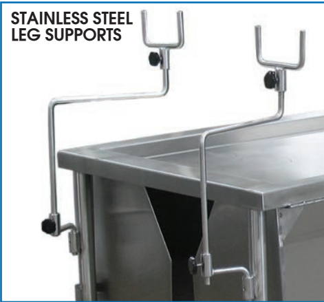
STAINLESS STEEL LEG SUPPORTS

Units are fabricated entirely of stainless steel. The "U" shaped leg supports can be swiveled. They feature a locking knob at the pole base to hold the support pole in position. The pole is designed to be placed at any corner of the table. All dissection tables come equipped with support sockets to accept the leg support pole.