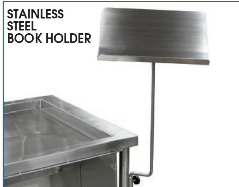
STAINLESS STEEL BOOK HOLDER

Stainless steel book holder supports literature for ease of viewing. They feature a locking knob at the pole base to hold the support pole in position. The pole is designed to be placed at any corner of the table. All dissection tables come equipped with support sockets to accept the leg support pole.