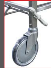
TOTAL LOCKING POSITION

Enables the carrier with "ONE LOCATION" locking to all casters, "ONE LOCATION" directional locking to assist in the steering of the carrier and "ONE LOCATION" locking release or neutral position.