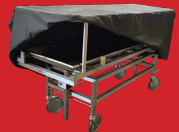
ALSO AVAILABLE MODEL 600040CTL

BRAKE FOUR WHEEL SYSTEM TOTAL WHEEL LOCK DUAL SIDE ACTIVATOR!