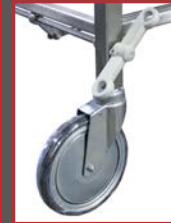
STEERING LOCKED POSITION