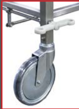
UNLOCKED -NEUTRAL POSITION

The unit allows for the concealed removal and transport of deceased from the hospital room to the morgue. A roller top frame allows easy transfer of body tray from carrier to lift or carrier to refrigerator. The unit features adjustable elevation and total locking system for casters to ensure stability while working.