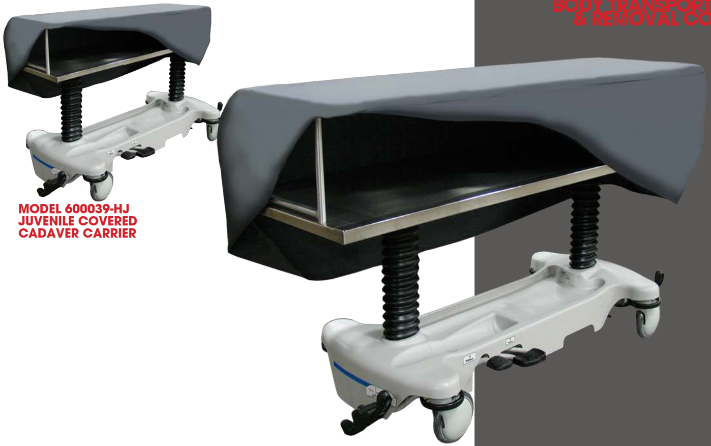
MODEL 600039-HJ JUVENILE COVERED CADAVER CARRIER