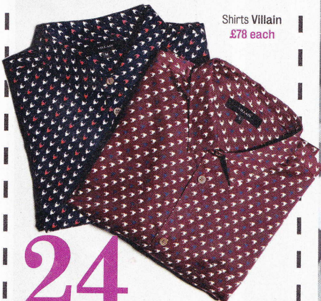
Shirts Villain £78 each