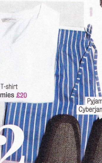
Pyjama bottoms Cyberjammies £22.50