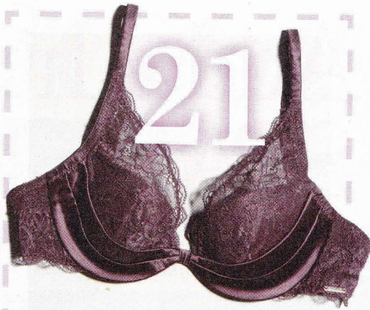
Bra and briefs Marks & Spencer £40