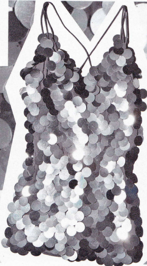
Mini dress Abbey Clancy for Matalan £30