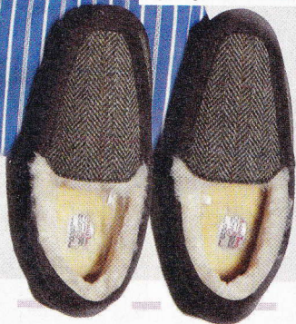
Slippers Just Sheepskin £60