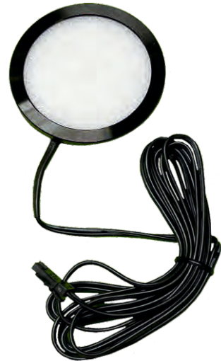
H8mm Dia 60mm 2m Cable