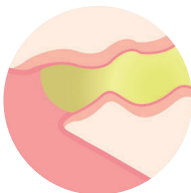
Airway with a mucus plug

The difference is that the average cough only happens once every 2 seconds. AirPhysio creates a series of mini coughs 15 to 35 times per second. This expands and contracts the airway walls at a faster rate, helping to shake and loosen the mucus, creating a more efficient and effective method of expelling the mucus and foreign particles from the lungs.