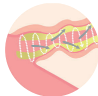
Pulses help thin and loosen mucus while the airways are held open