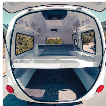
VEND WITH INTERIOR SERVING BARS