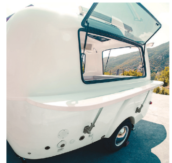
POWER OPTIONS FOR COMMERCIAL USAGE