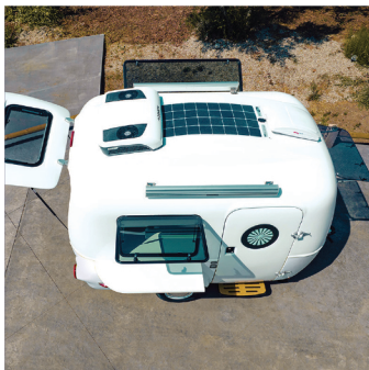
EYE-CATCHING & ELEVATED DESIGN