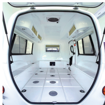
FULLY MODULAR INTERIOR