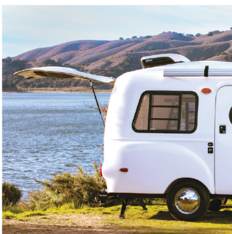
SIGNATURE REAR HATCH