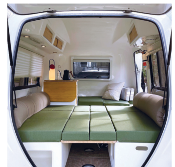
SELF-SUSTAINED AND OFF-GRID READY