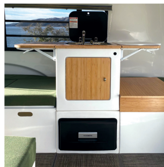
KITCHENETTE AND TOILET OPTIONS