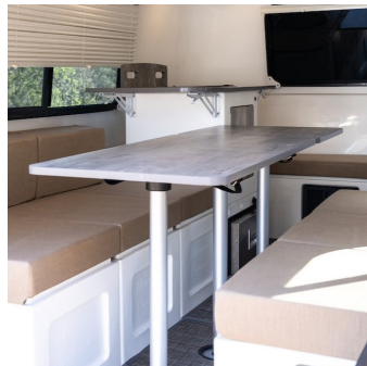
FULLY MODULAR INTERIOR