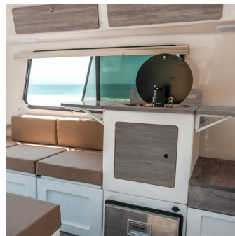
KITCHENETTE AND TOILET OPTIONS