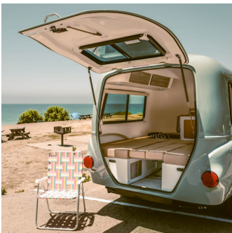
SIGNATURE REAR HATCH