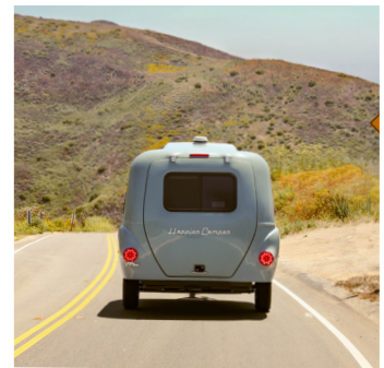
SELF-SUSTAINED AND ADVENTURE READY