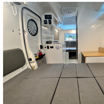
SPACIOUS & EFFICIENT DESIGN