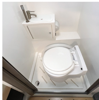
SHOWER & TOILET FEATURES