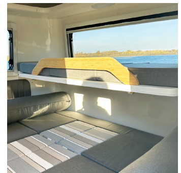
ADD BUNK BEDS TO SLEEP MORE