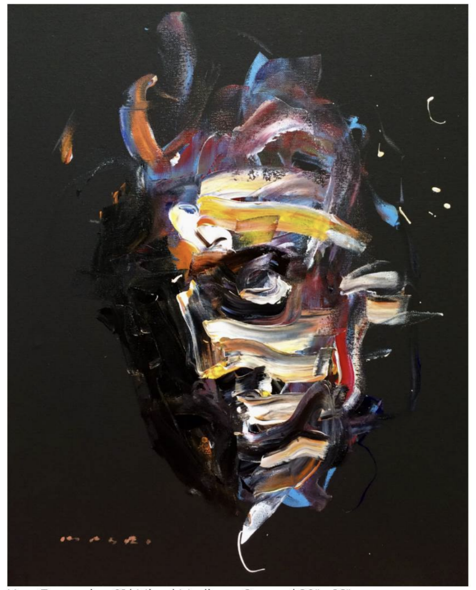
New Expression 01 | Mixed Media on Canvas | 20" x 16"

Artist Portfolio Magazine Issue #50, USA