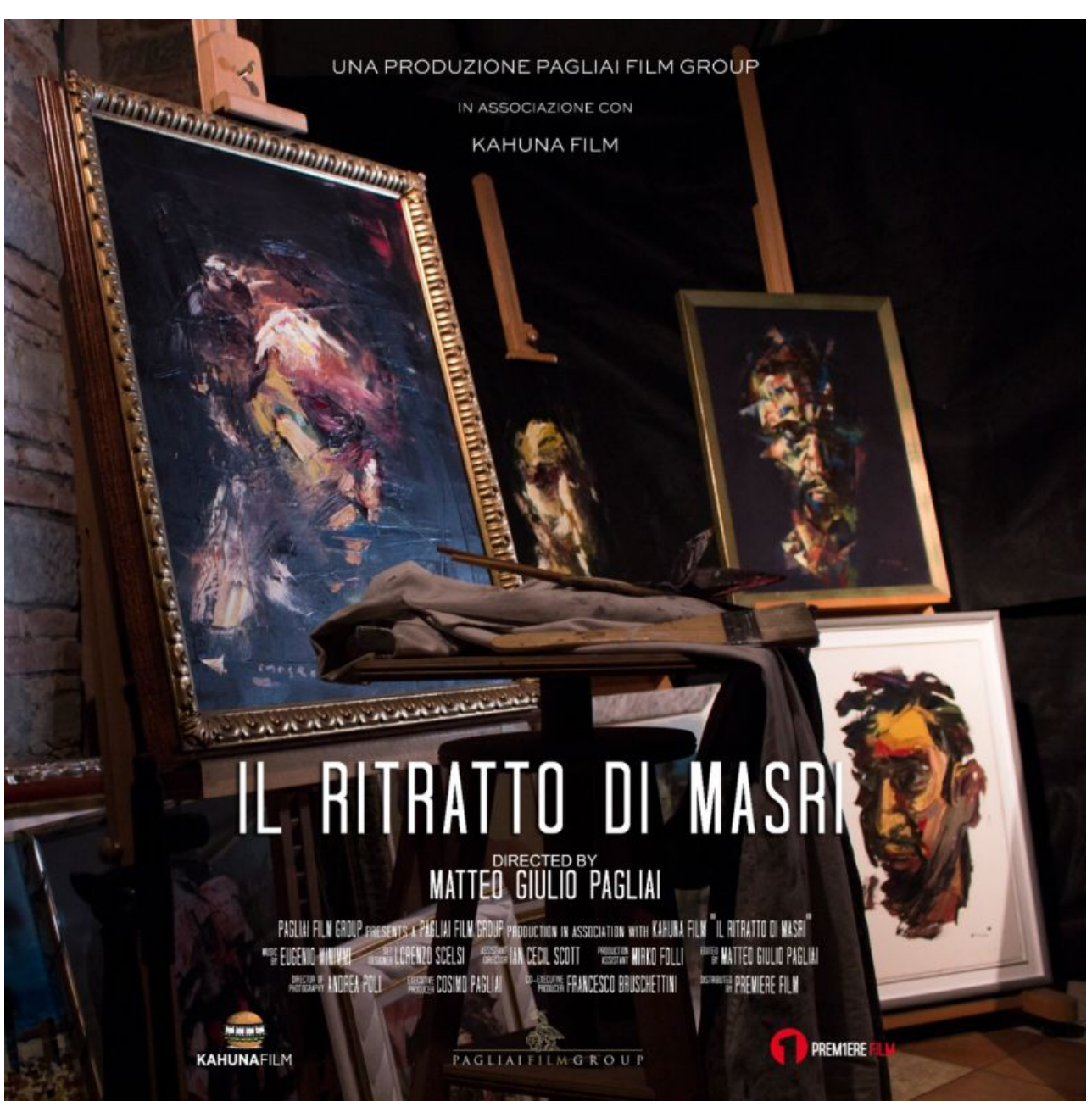
Documentary "The Portrait of Masri" by Pagliai Film Group in association with Kahuna Film