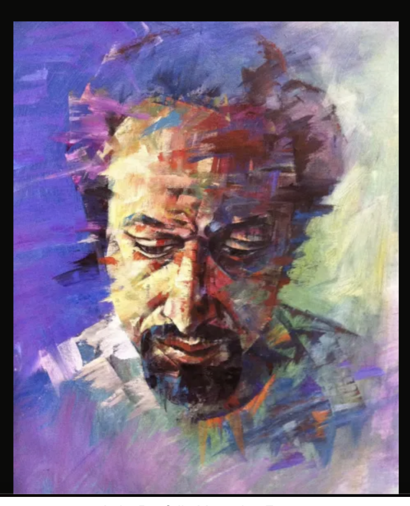
Artist Portfolio Magazine Feature

It is easy for one to be haughty, vainglorious and pretentious, but to be humble needs deep understanding to the universal truth in the conscience of the universe