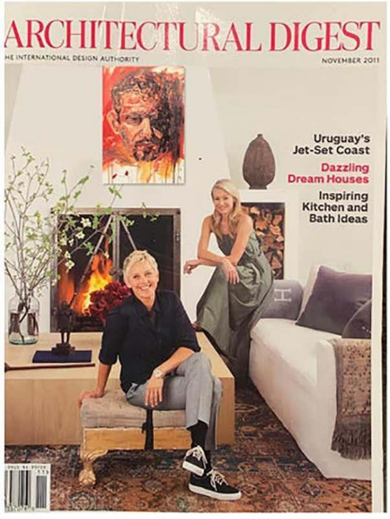
Masri's work at Ellen Degeneres's house