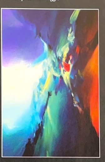
Luci e colori acrilico su tela, cm 120x100

Studio in Firenze Borgo Ognissanti 63/r tel/Fax 055-268618 Cell. 339-5481624 e-mail:masri@artmasri.com