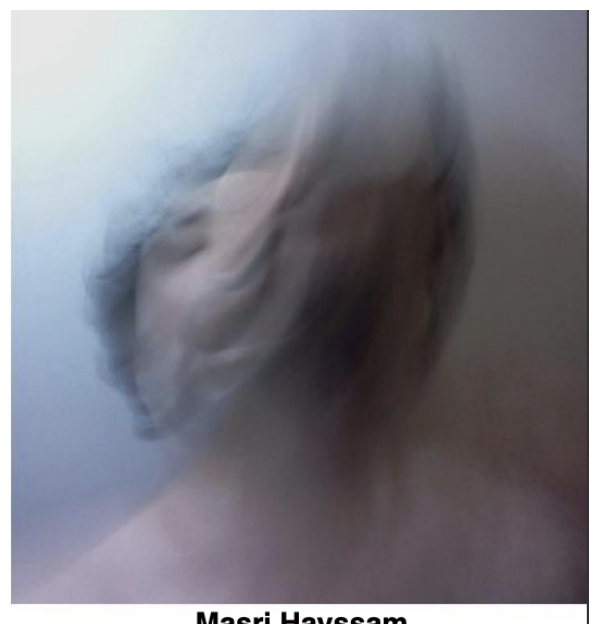
Masri Hayssam Out of Me - Self Portrait http://www.artworksmasri.com