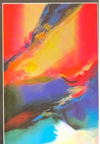
Brano Sconosciuto acrilico su tela, cm 120x80

Masri Hayssam è un giovane pittore libanese di grande qualità pittorica costantemente proteso alla conquista di una propria individualità estetica. L'artista si cimenta in varie forme espressive: grafica, scultura, pittura raggiungendo in ognuna di tali forme vette davvero singolari. Di solida cultura europea Masri attraversa esperienze che vanno dall'impressionismo all'espressionismo per