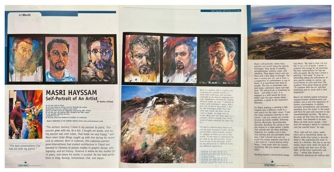
Cedar Wings Issue #79, Lebanon