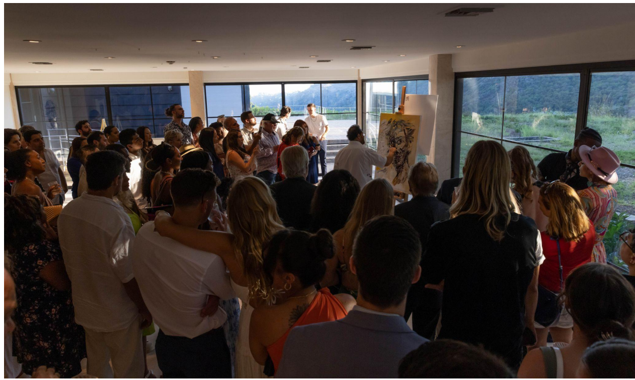
Portraits Throughout Time - The Brentwood Oak Ranch + AAG