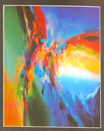
Paesaggio dell'anima acrilico si tela, cm140x100