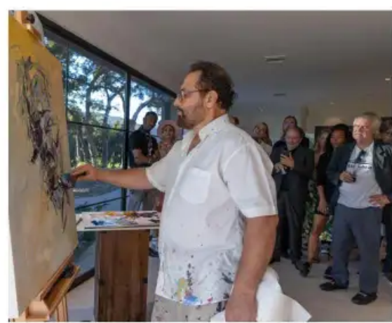
Masri Live Painting at the 2023 LA "Portraits Throughout Time" Exhibit