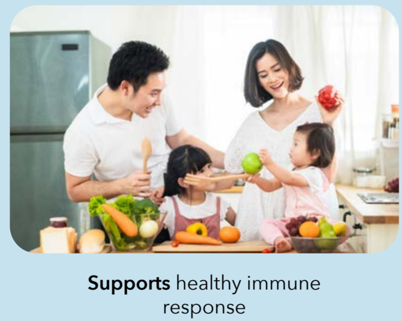
Supports healthy immune response