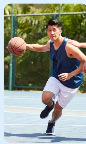
Assists in joint mobility