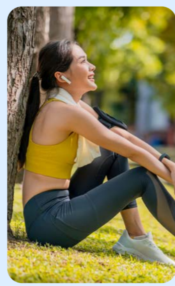
Supports joint health

US Clinicals® Triple Strength Glucosamine Chondroitin + MSM combines the best of science and nature to support healthy joint function.