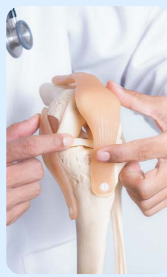
Promotes lubrication for joints