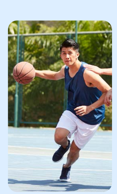
Assists in joint mobility