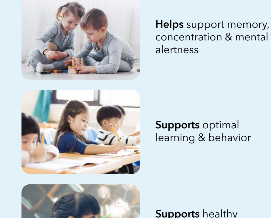
concentration & mental alertness