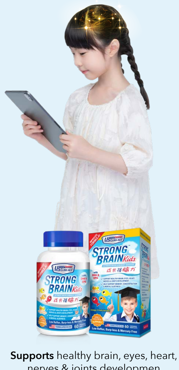
nerves & joints developmen