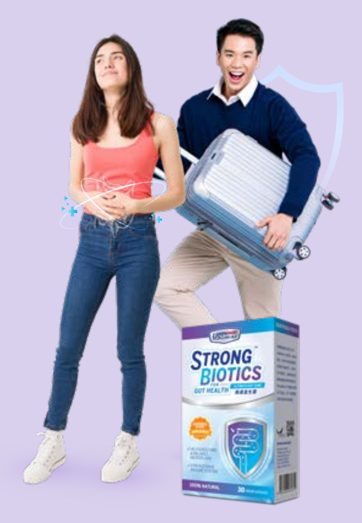
Strengthen immune system