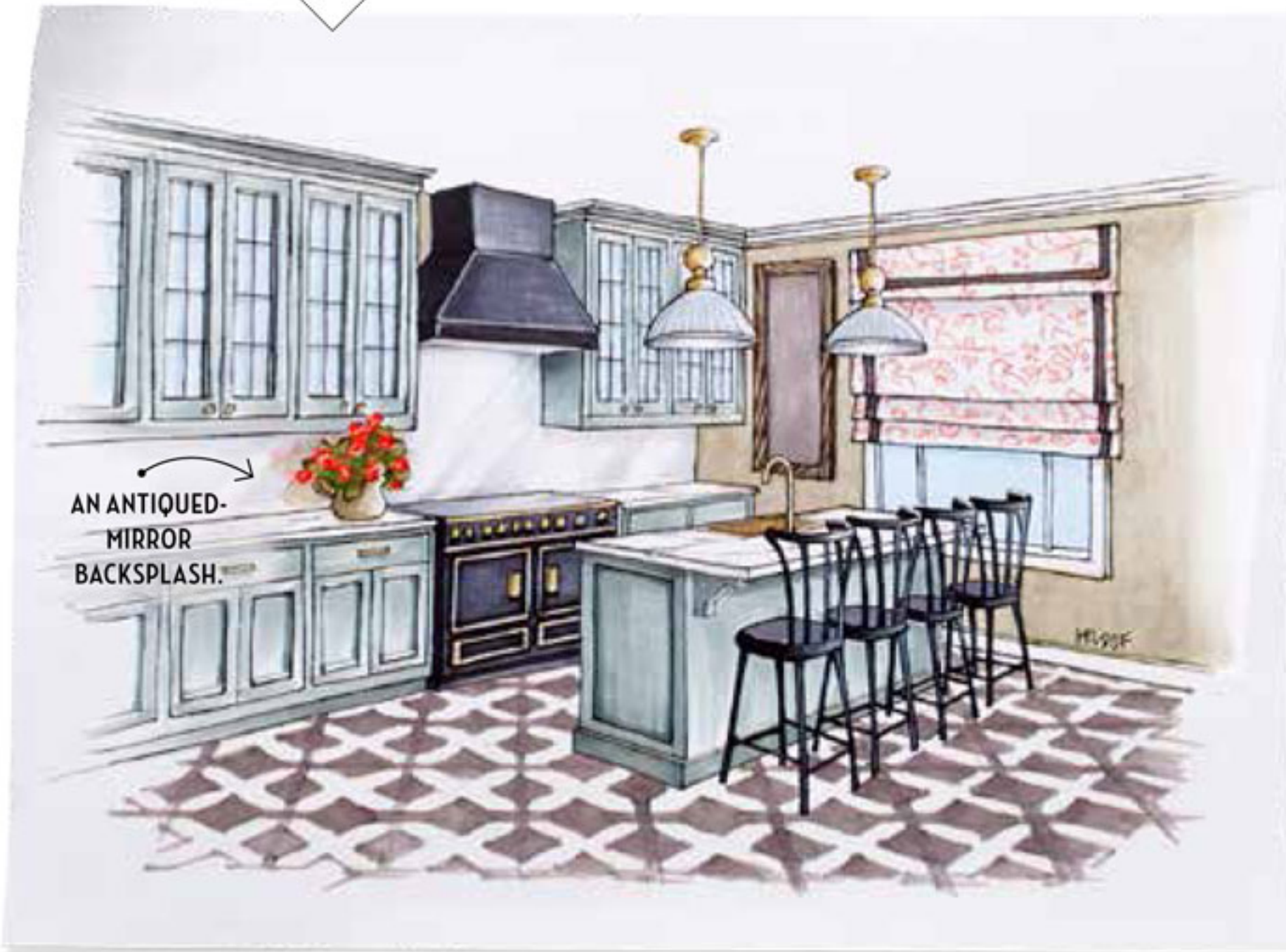
AN ANTIQUED-MIRROR BACKSPLASH.

The Manhattan-based designer imagines a modern country-house kitchen with industrial touches. She starts with a soothing palette, so the brass details and saturated colors really pop.