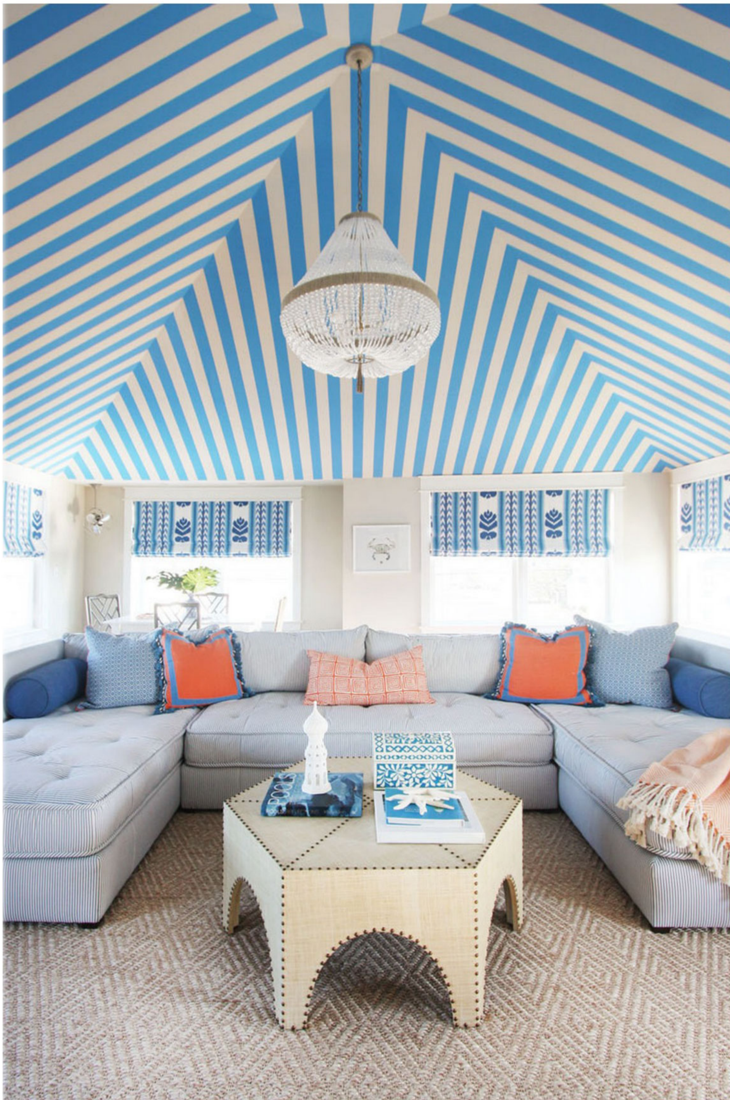
A custom U-shaped sectional by Lee Industries and a raffia-covered table by Palecek evoke a lounge-like mood in the media room designed by Jenny Wolf Interiors.