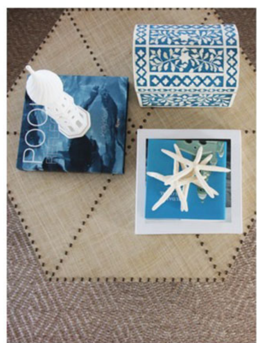
Decorative objects in the home's media room.