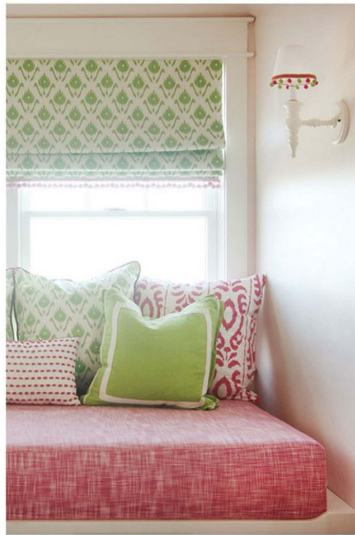
Pompoms and pillows embellish a cozy reading nook.