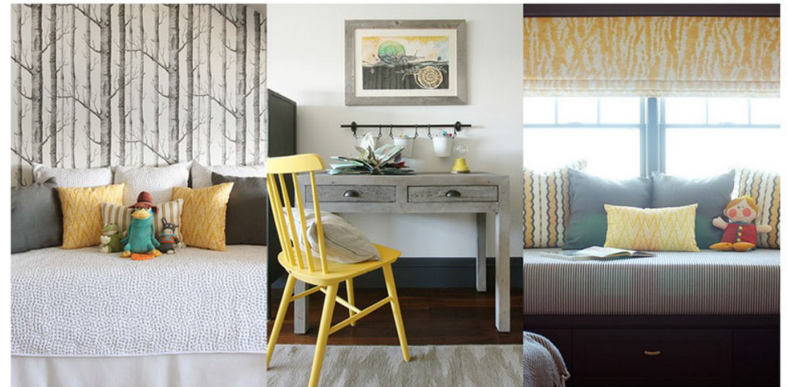
With its versatile palette and upholstered daybed, the boy's room is set up to grow with him.

An infusion of lively hues and eye-catching patterns make this a memorable retreat for the clients' twin eight-year-old girls. The pairing of fuchsia and kelly green is tempered with walls, bed linens, and accessories in soft creams and whites. The seating nook overlooking the water has drawers underneath for toy storage and is the perfect place to curl up with a classic childhood read. Decorative flourishes add even more character: pom-pom trim on window treatments and adjoining sconces, as well as hot-pink tassels on the dresser.