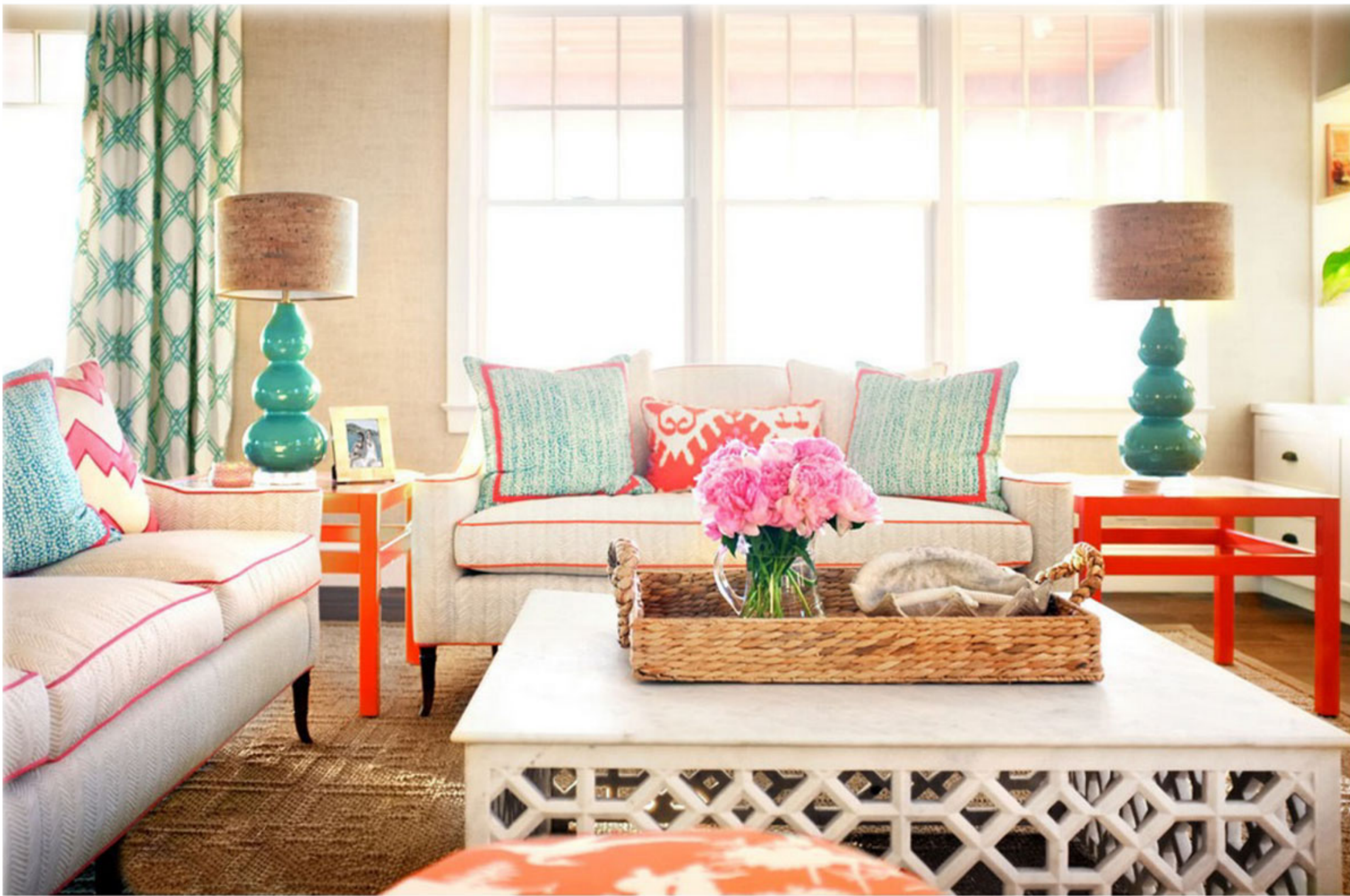
High-contrast piping on the sofas, as well as orange-lacquer side tables, make this living area come alive.