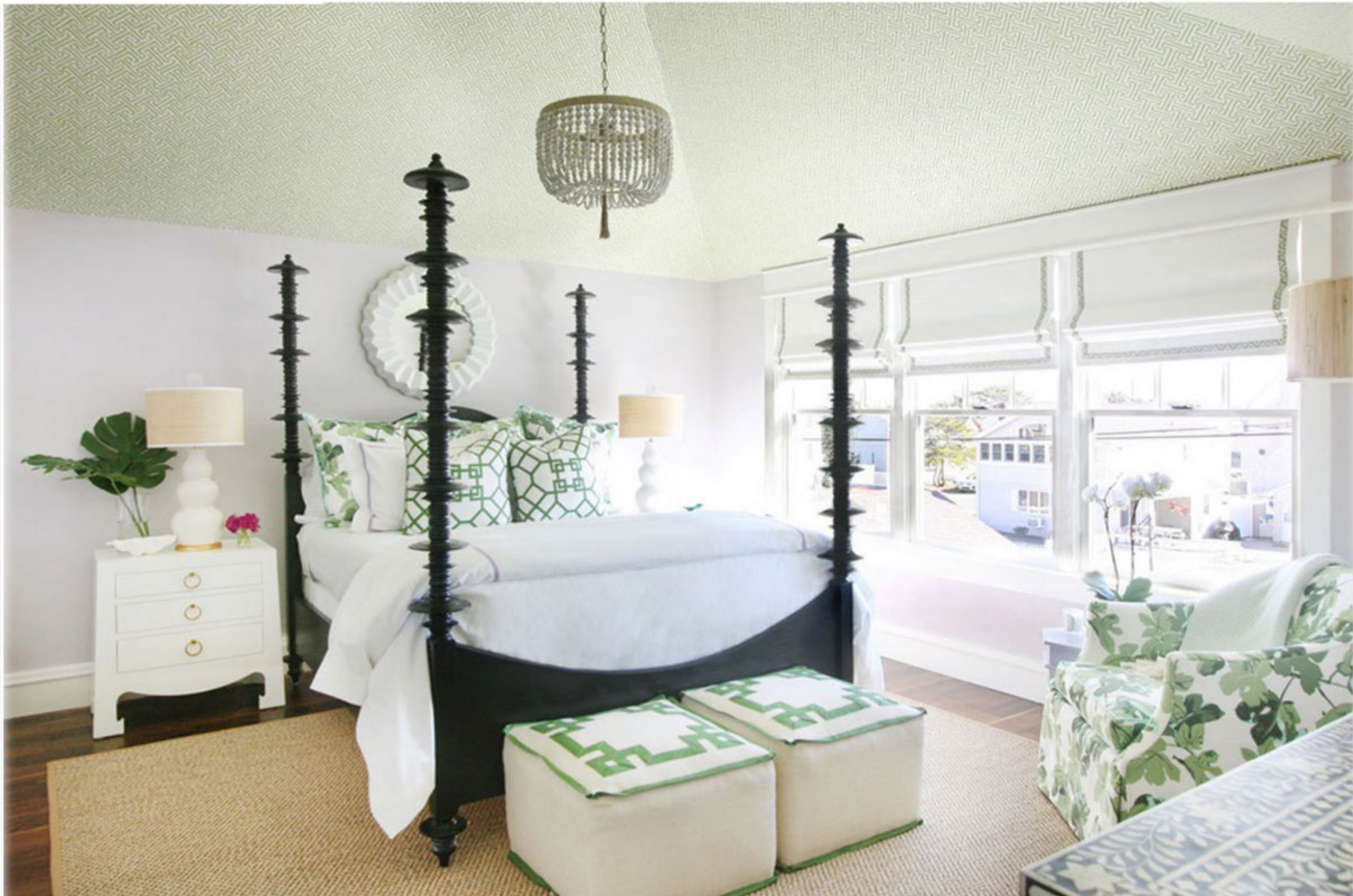
In the guest room, a leafy textile pattern spurs the decorating scheme. The children's bathroom, above center, brings in a similar mint-green hue.