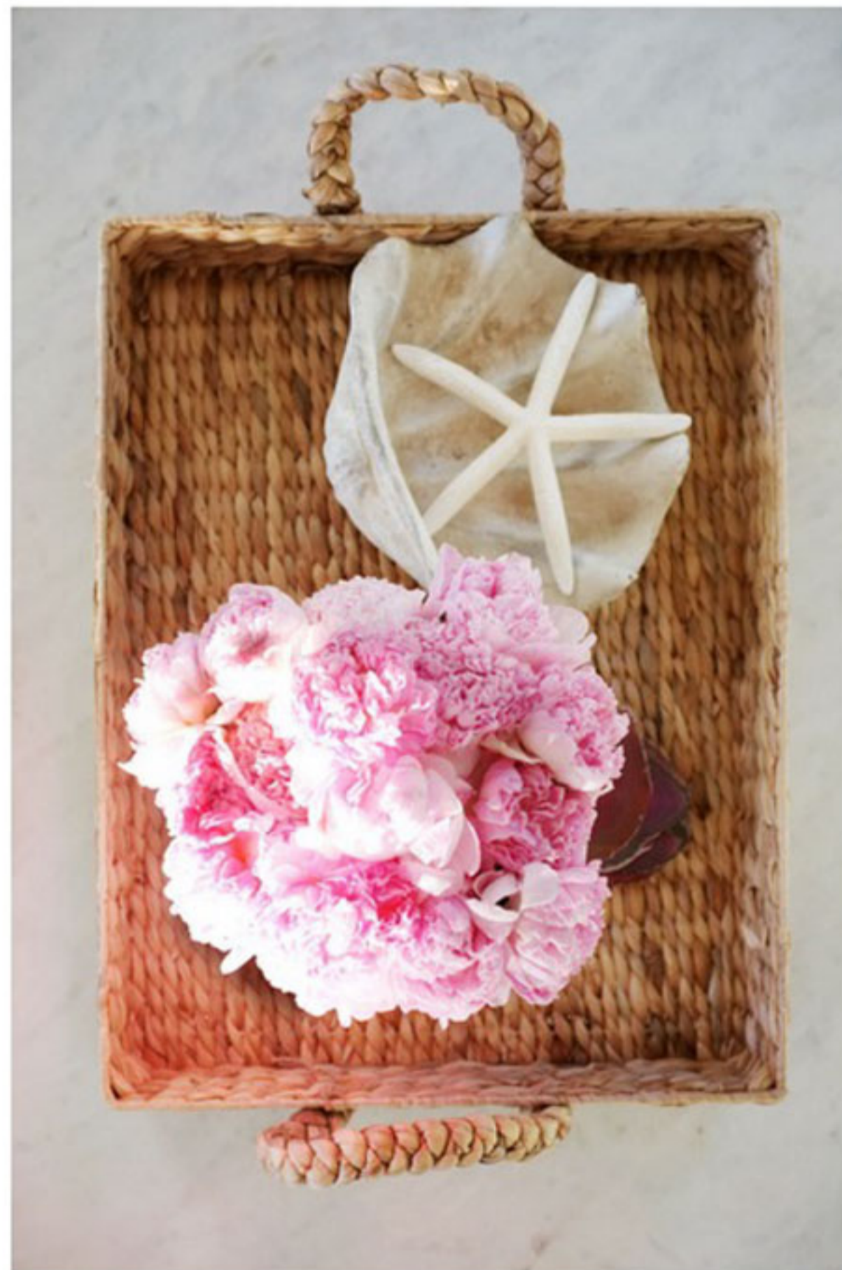
A rattan tray acts as a textural table element.