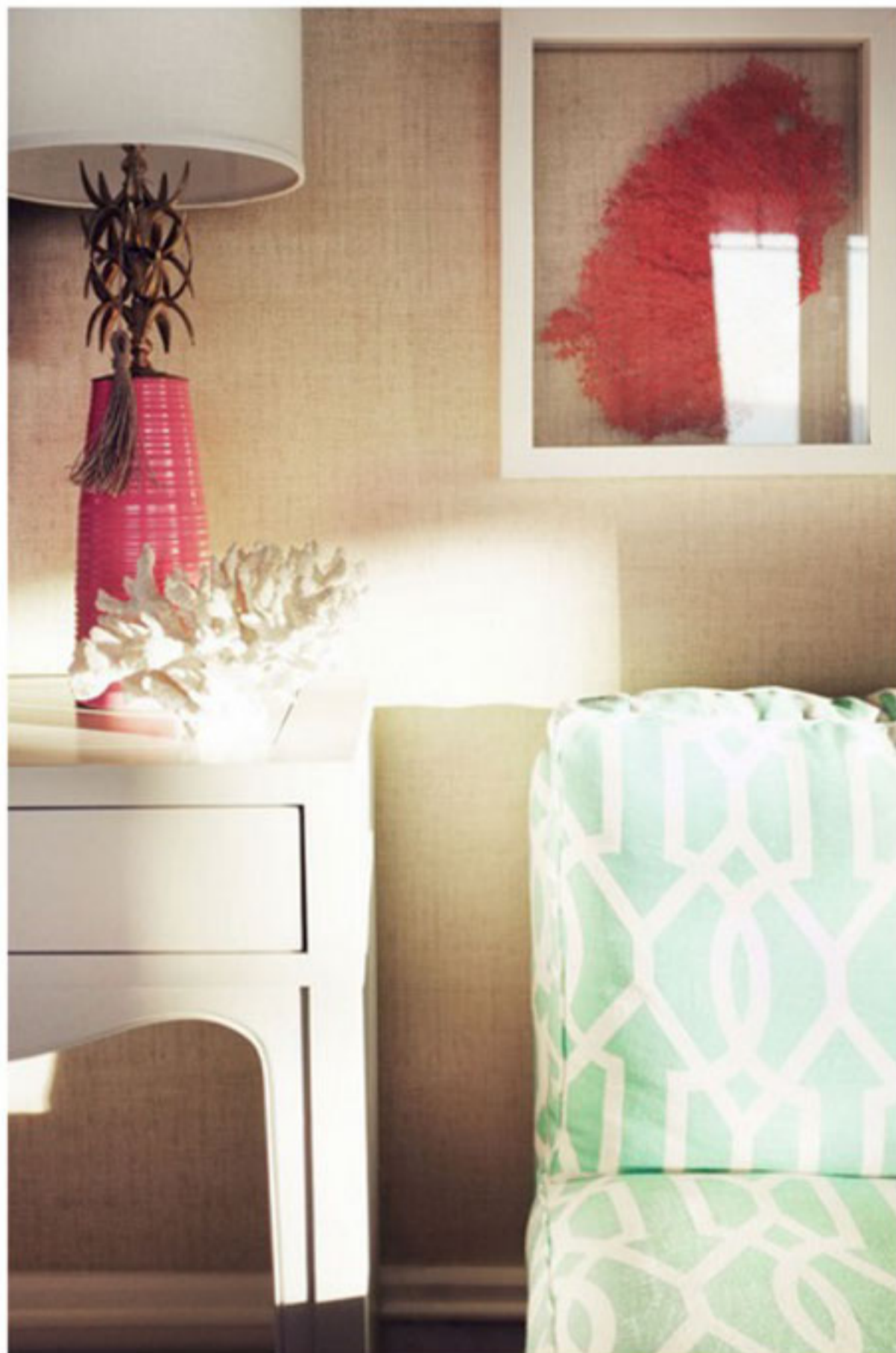
The vinyl grasscloth wall covering is ideal for coastal homes.