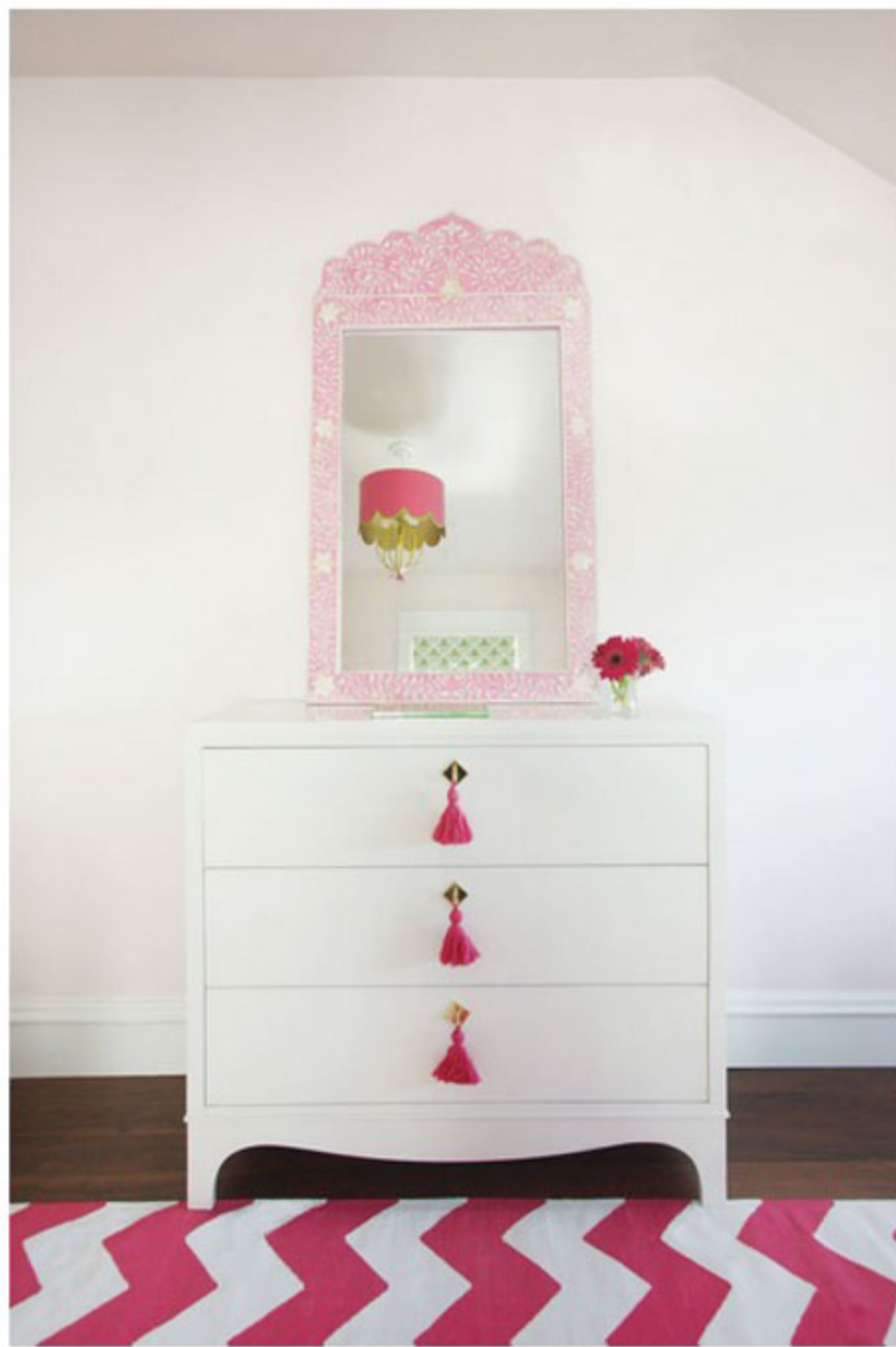
Tassels and a whimsical light fixture grace the girls' room.