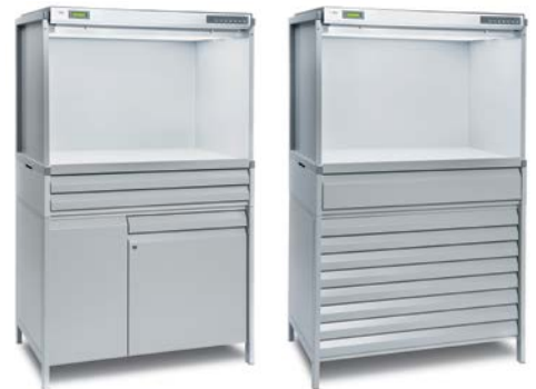
CMB-2540 shown with two shallow flat file drawers and storage cabinet at left; and shown with one deep file drawer and eight shallow flat file drawers at right.