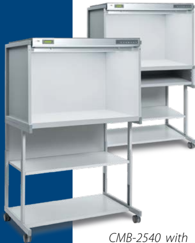
CMB-2540 with floor stand at left; and with floor stand and table riser at right.