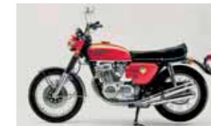
The Dream CB750 FOUR, which hit the market in 1969

After 5 consecutive titles in the World Grand Prix Road Racing Series, Honda decided to withdraw and turn toward its primary target: transfer the technology obtained in competition to develop high-performance consumer machines. After an initial attempt with a 450cc machine, Honda released the CB750 Four in 1969. The initial production forecast of 1,500 units a year soon became a monthly figure and then jumped to 3,000 units per month. By pushing the boundaries of performance, reliability and easy handling in motorcycles, Honda created a new class of Superbike. The CB1000R is the modern expression of the same spirit that has guided Honda engineers for decades.