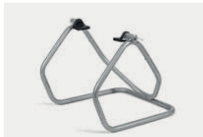
REAR MAINTENANCE STAND 08M50-MW0-801

Tilting tubular steel stand that facilitates cleaning and rear wheel maintenance. Lifts the motorcycle by the end of its swingarm.