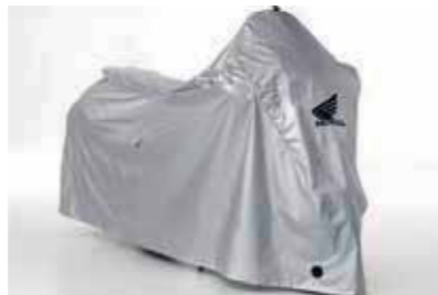
OUTDOOR CYCLE COVER XL 08P34-BC2-801

Tilting tubular steel stand that facilitates cleaning and rear wheel maintenance. Lifts the motorcycle by the end of its swingarm.