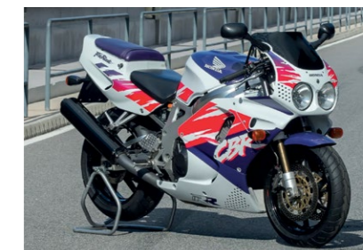
The CBR900RR Fireblade that started all.

Aiming to create a high-performance motorcycle that could defeat its own RVF750 in Endurance Road Races, Honda developed an R&D project that led directly to the CBR900RR in 1992. With 128 HP, it was not the most powerful of its time however thanks to a dry weight of 185 kg when all rivals were well over 200 kg the Fireblade was so easy to control that it seemed to read its rider's mind. Now 30 years on, the most powerful and nimble Honda bikes keep carrying the Blade legacy.