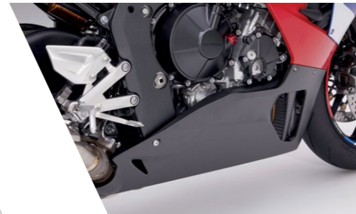
CARBON UNDER COWL 08F73-MKR-D10

The Carbon Under Cowl is made from the same lightweight, high-strength Carbon Fibre used on the RC213V-S MotoGP machine. In addition to reducing the weight of the Fireblade, the intense matt finish increases its racing appeal. Follows the same shape as the standard part but moulded in one piece and 25% lighter.