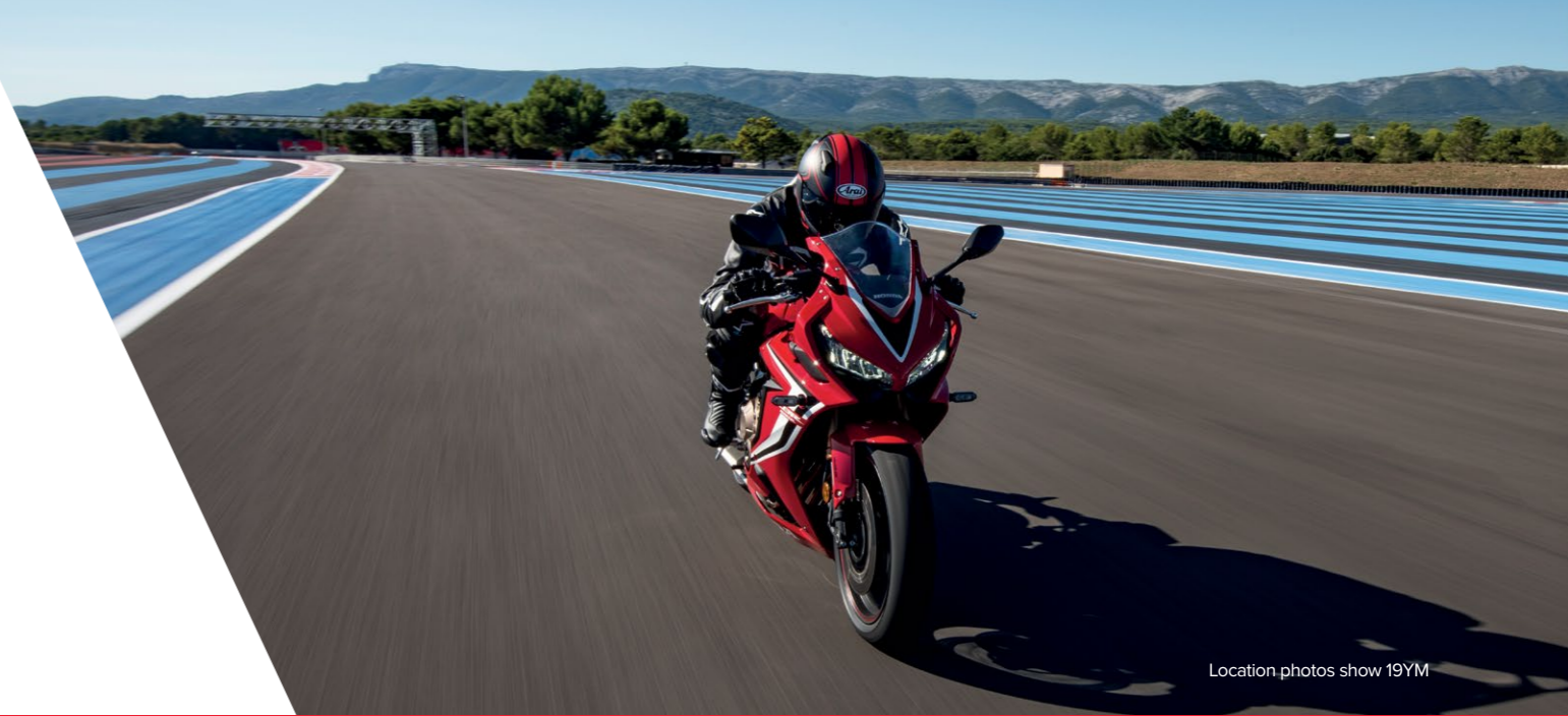
Location photos show 19YM

A simple and functional rear bag specifically adapted to the tapered shape of the CBR650R's rear seat. Easy and stable mounting is ensured thanks to the specific attachment kit provided. It's 15 Litre storage capacity expandable to up 22 Litres and a Rain cover included.