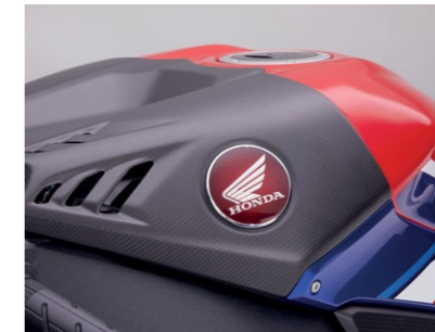
CARBON AIRBOX COVER 08F74-MKR-D10

The Quickshifter communicates shift pedal inputs to the ECU. In return, the ECU removes the load from the transmission and allows seamless upshifts downshifts without operating the clutch. The Quickshifter auto-blip functionality guarantees smooth and instantaneous down-shifts, contributing to a stress-free experience for both sporty and long-distances riding. For Fireblade RR-R version only.