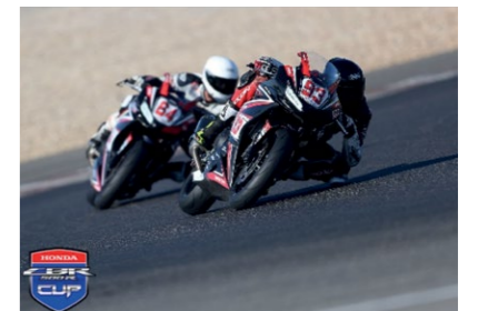
The CBR500R Cup.

It's not rare to find some CB500s proudly boasting more than 180,000 miles but the long-time favourite of the couriers and the driving school is much more than just a workhorse. Beginning in France in 1996, the CB500 Cup spread across Europe quickly. Since 2014, it is the CBR500R that young talents try to make a name by themselves on a budget. Sebastien Charpentier or James Toseland, to name a few, started there.