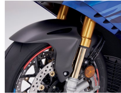
CARBON FRONT FENDER 08F71-MKR-D10

Made of high-quality, precision-cut aluminium, this red anodised filler cap features a laser-etched HRC logo on both sides. The inside has been hollowed out to both increase strength and reduce weight. For circuit riding, the cap also features the same wire-lock hole used on HRC works machines