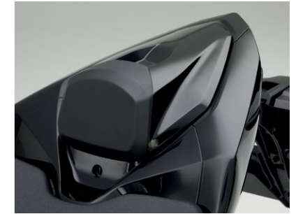
REAR SEAT COWL

Made from the same lightweight, high-strength Carbon Fibre used on the RC213V-S MotoGP machine, this Carbon Hugger reduces the Fireblade's unsprung weight. It follows the same shape as the standard part but is 10% lighter.