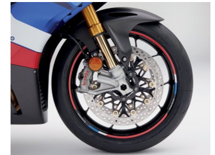
WHEEL STRIPES SET - TRICOLOUR 08F79-MKR-D10ZA

Made from the same lightweight, high-strength Carbon Fibre used on the RC213V-S MotoGP machine. The Carbon Fibre Airbox is the same shape and size as the standard part but 25% lighter.