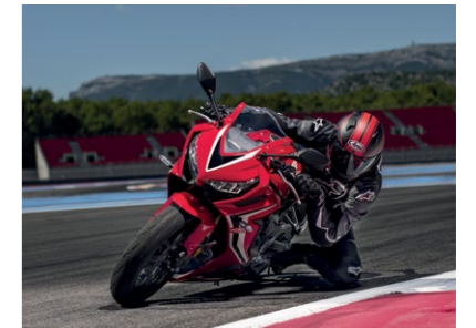
The CBR650R in action.

Since 1999 with the ST1100 Pan European, Honda have equipped more and more of its motorcycles with a system called Honda Selectable Torque Control (HSTC). This system constantly monitors the speeds of the front and rear wheels via speed sensors incorporated into the Anti-Lock Braking System (ABS). When the rear wheel begins to rotate significantly faster than the front, the systems reduces fuel delivery to the engine, limiting rear-wheel slippage. In 2019 with the new CBR650R, Honda applied this technology to its mid-displacement Supersport motorcycle for the first time.