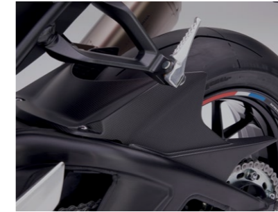
CARBON REAR HUGGER 08F70-MKR-D10

Made from the same lightweight, high-strength Carbon Fibre used on the RC213V-S MotoGP machine, the Carbon Front Fender reduces the Fireblade's unsprung weight. Follows the same shape as the standard part but is 38% lighter.