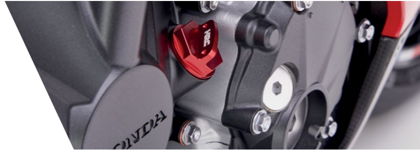
HRC OIL FILLER CAP 08F81-MKR-D10

Made of high-quality, precision-cut aluminium, this red anodised filler cap features a laser-etched HRC logo on both sides. The inside has been hollowed out to both increase strength and reduce weight. For circuit riding, the cap also features the same wire-lock hole used on HRC works machines