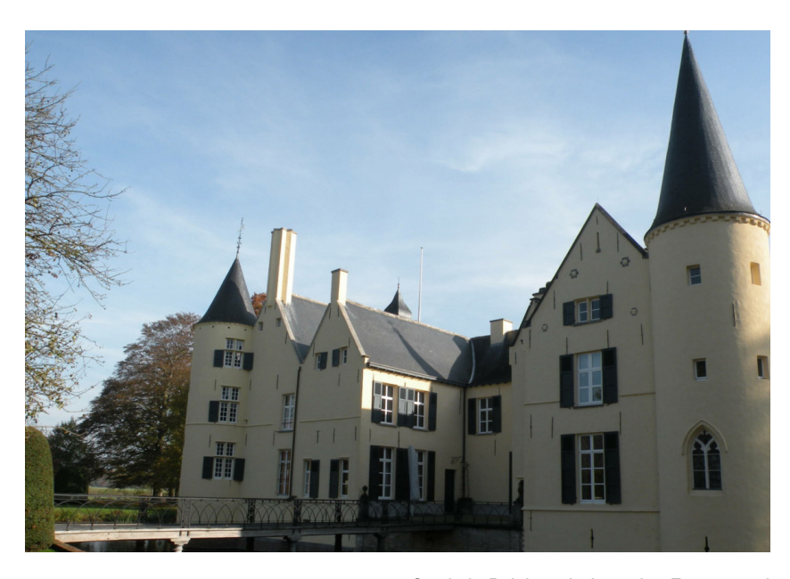
Castle in Belgium | Autentico Esterno and Vivace

Our tagline: "from painting furniture to castles", is something we are very proud of and is being brought to practice daily.