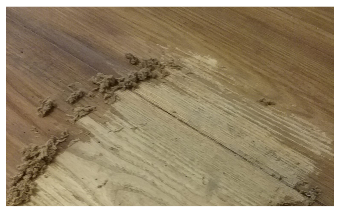
Preparation | Autentico Bio Strip

Other projects require more preparation. Walls may need an undercoat, or existing stains must be insulated. We have all the necessary preparation products available. If you are in doubt, contact us via the chatbox on our website or at support@autentico-paint.com. We are here to help.