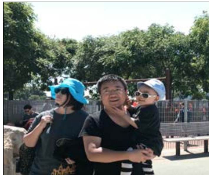
Above: Story on Page 12