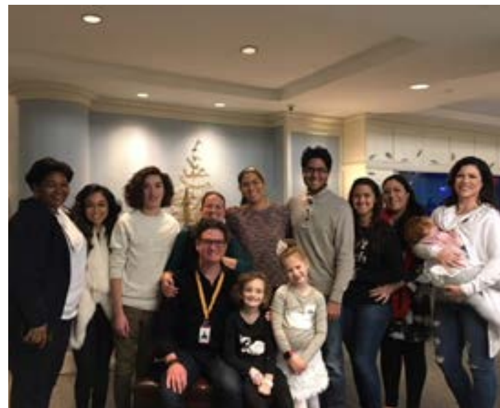
Above: Story on Page 18