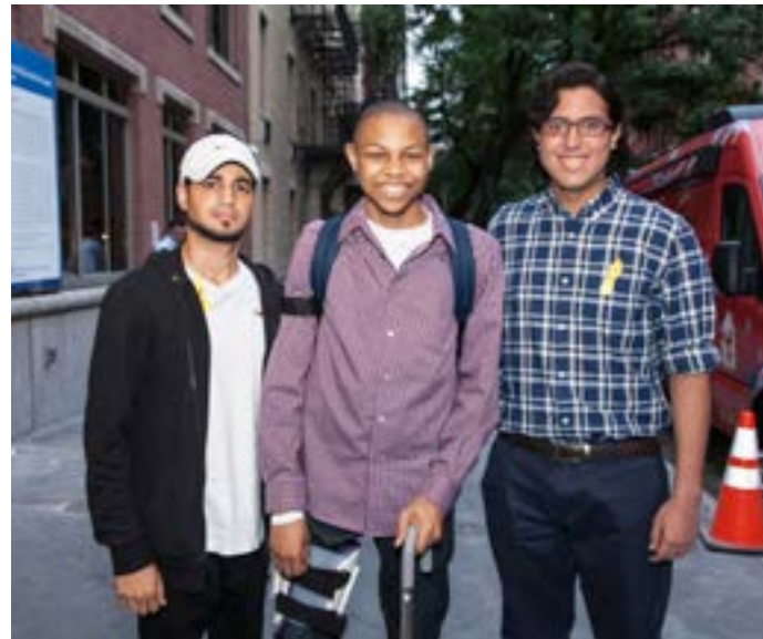
Above: Guests of RMH-NY were all smiles as they walked through the doors of RMH-NY's updated facility.