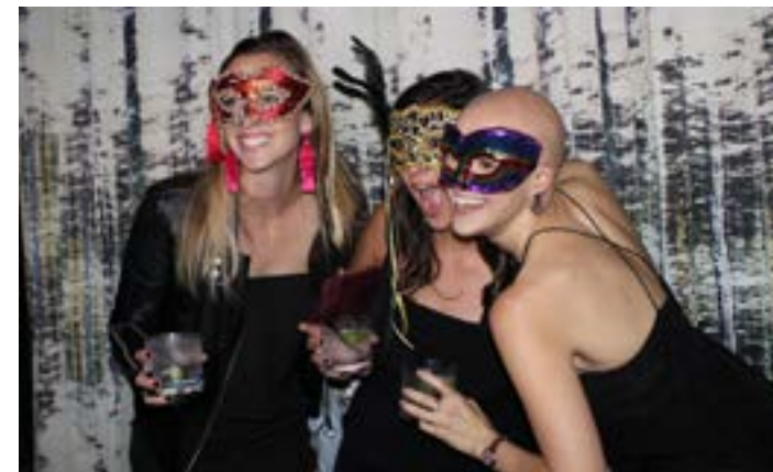
Above: Guests at the 2017 Masquerade