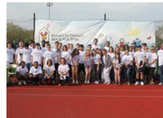
2017 Queens Family Fun Run at St. John's University