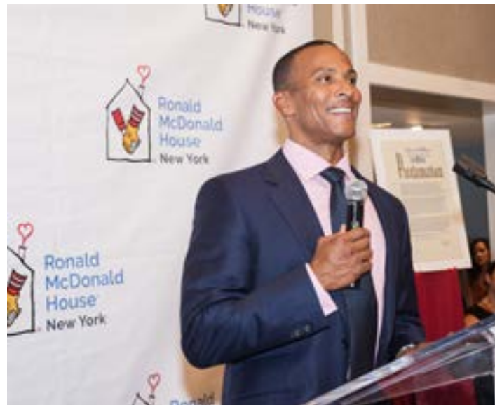
Above: Mike Woods of FOX 5's Good Day New York served as Master of Ceremonies.

The six post-transplant suites, which are on average 70-90% larger than standard rooms, allow the House to cater to families who have children that recently received a transplant. These new rooms meet the needs of children with recent bone-marrow transplants who must stay in relative isolation for up to three months following treatment while their immune systems recuperate.