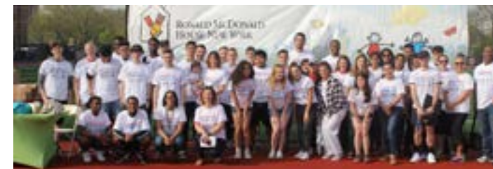
Over 400 people gathered at DaSilva Memorial track at St. John's University for the 2 nd Annual Queens Family Fun Run and Walk. The participants ranged in ages 4 through 17 for the Run, and entire families participated in the Walk raising over $56,000.