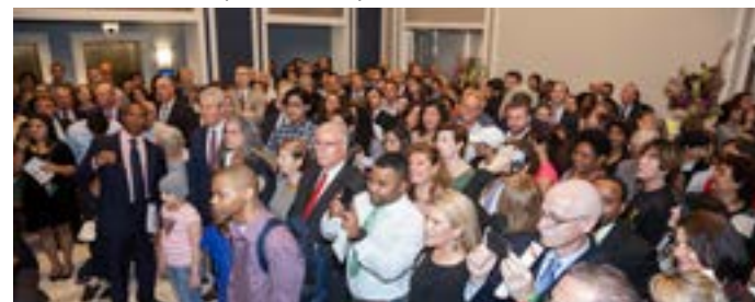
Above: Over 250 guests gathered in the Sol and Margaret Berger Foundation Lobby to celebrate the Grand Re-Opening.