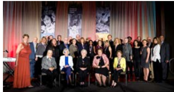
Below: All past recipients of the Volunteer Hope Award