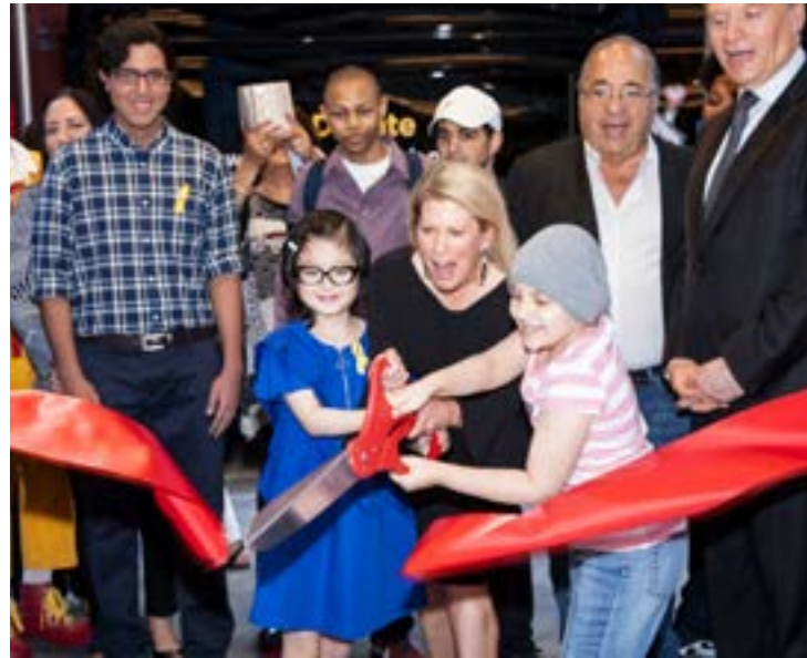
Above: Story on Page 6