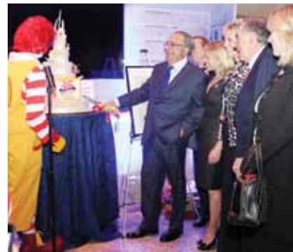
35 th Anniversary celebration.