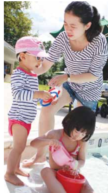
Our Chinese guests enjoyed the joys of summer in New York City as a part of Camp Ronald.