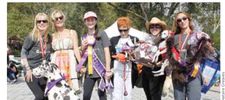
Thank you to our hosts, grand marshal, participants and sponsors.