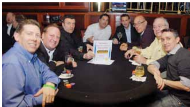
Thanks to all attendees, sponsors and volunteers who made casino night a success!

The third annual Casino Night held by Children’s Happy Faces Foundation at Fino Wall Street raised more than $46,000. With 175 people in attendance, the event featured a Texas Hold’em-style poker tournament, blackjack tables, roulette wheel, silent and live auctions, a live jazz quartet, open bar, chair massages by Oasis Day Spa, Fur Show by ‘Not Just Mink,’ a cigar hand-out by Macanudo Cigars, all topped off by a sumptuous feast provided by Fino Wall Street. Funds from the event will help to support programming events for Ronald McDonald House New York families.