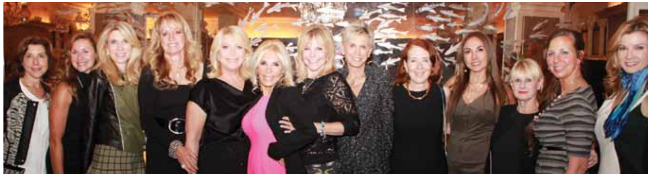
Above: Power of the Purse committee members. Below: donated purses for auction.