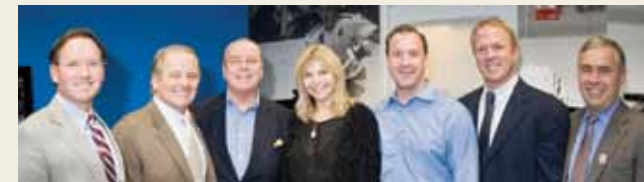
Photo Flashback: On Friday, November 4th, 2011, our friends at the New York Rangers Organization, Garden of Dreams Foundation, RBC Capital Markets, the Heller Foundation, Zurich, The International Securities Exchange and the National Hockey League Cancer Fund were on-hand for the ribbon cutting ceremony to announce the opening of our Rangers Room.