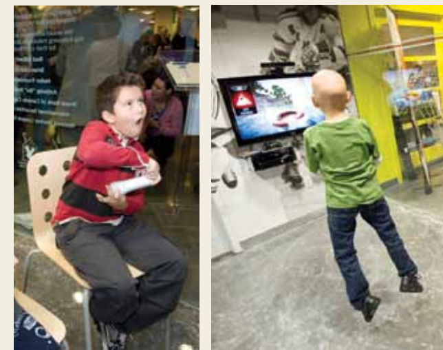
From top to bottom: RMH-NY leadership with Rod Gilbert and Brian Leetch; the ribbon cutting moment; RMH-NY guests enjoying the Rangers room.