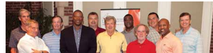
Above: 2013 Celebrity Golf Attendees. Below: 2013 Celebrity Golf Committee members