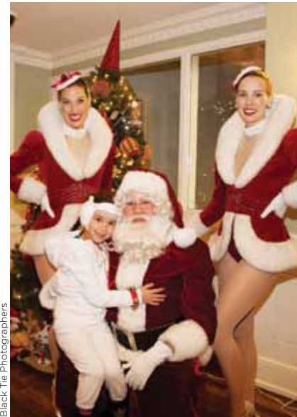
Share a Night with Santa and the Radio City Rockettes

For a family seeking the warmth and loving traditions that they're accustomed to during the holiday season, being away from home can be especially difficult. Feelings of melancholy and anxiety tend to run high during that particular time of year at Ronald McDonald House New York. To that end, we try to help families maintain a sense of normalcy by incorporating social activities and support services that will help them to remain connected in some way to home and family abroad.