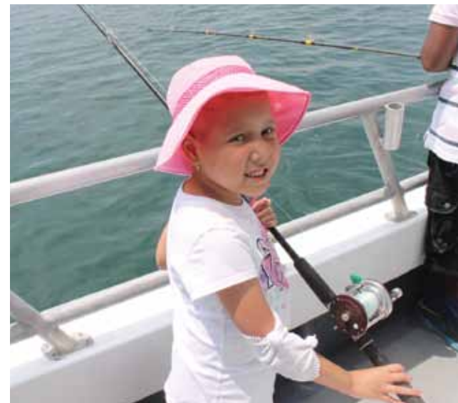
Above and right: enjoying a lovely day on the water during Camp Ronald McDonald.