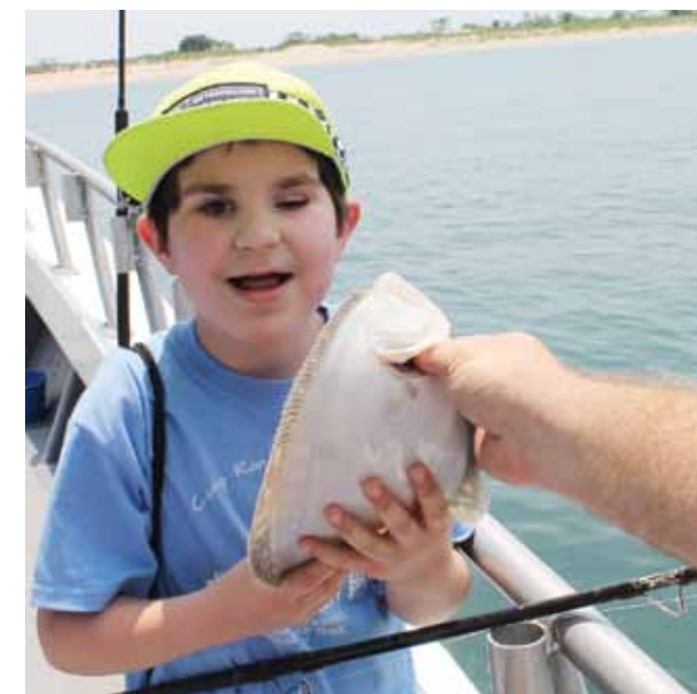
Summer Camp + Deep Sea Fishing = Big Smiles!

We would like to thank all of our friends and donors for providing our families with the most wonderful summer in the history of Camp Ronald McDonald. ■