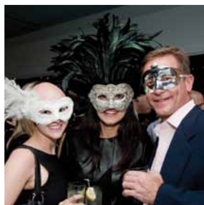
Revelers at the 2012 Masquerade event.