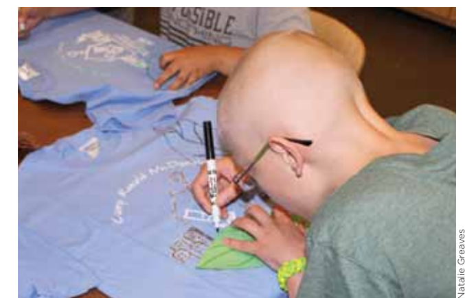
Camp kicked off with a tropical theme and attendees began the summer by personalizing their shirts.