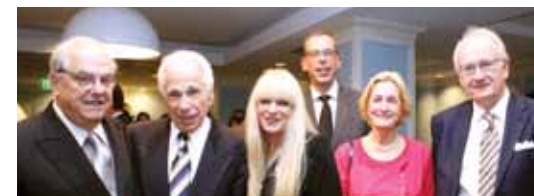
Rotary Club of NY leadership