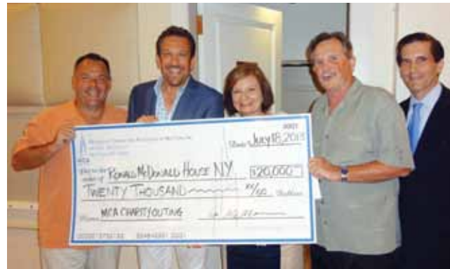
The Mechanical Contractors Association of New York donates a check for $20,000.