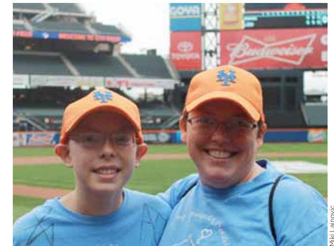
Summer isn't complete without a trip to the ballpark.