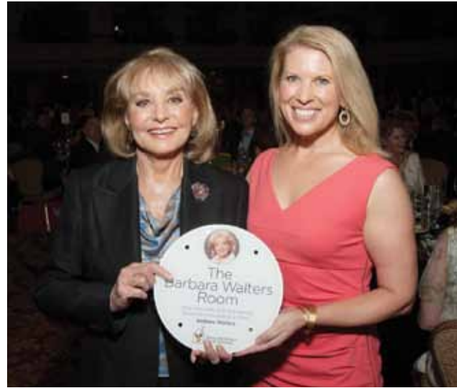
Introducing the Barbara Walters Room