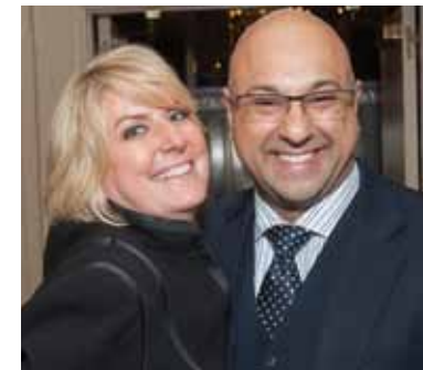
Felicia Taylor & Ali Velshi