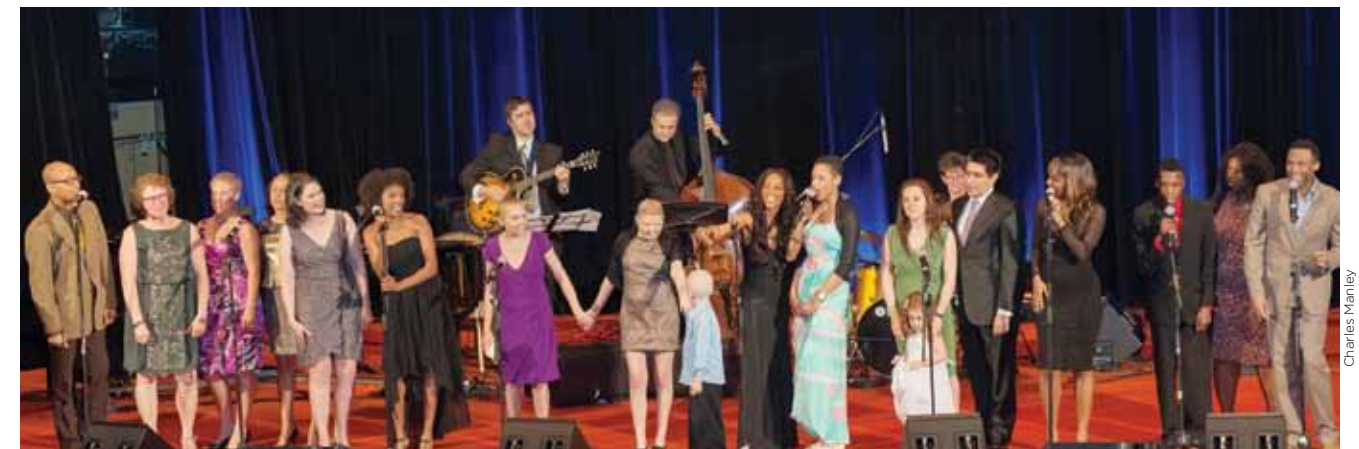
Ronald McDonald House New York Residents Singing "Reach Out and Touch Somebody's Hand"