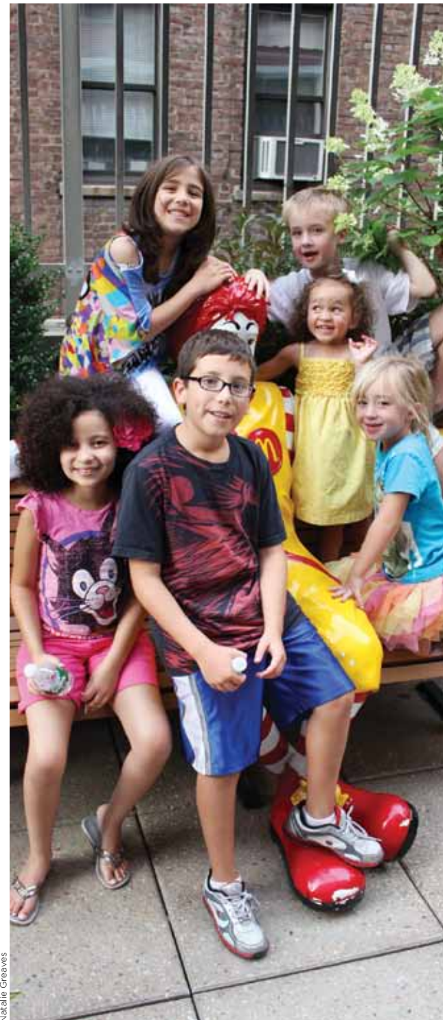
A moment in time, the picture of total health. Help us to make this a reality for all of our children.

Since its founding in 1978, Ronald McDonald House® New York and its nearly 30,000 guests — children who are battling pediatric cancer and their caregivers — have been the grateful beneficiaries of generous giving, which is one of the most powerful acts on earth.