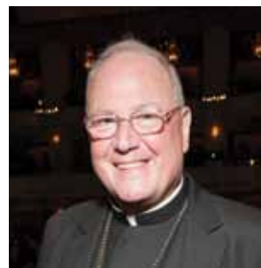
Timothy Cardinal Dolan