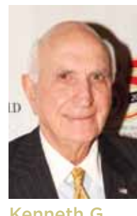
Kenneth G. Langone