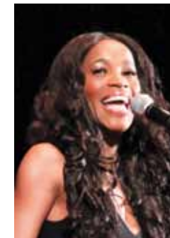
"Motown: The Musical" star Valisia LeKae