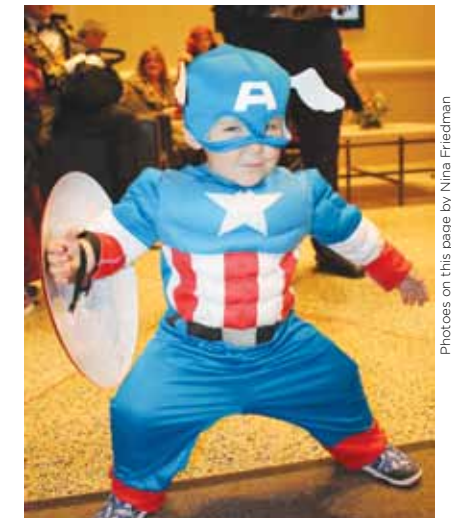
Little superheroes donned their special attire for a Halloween event.