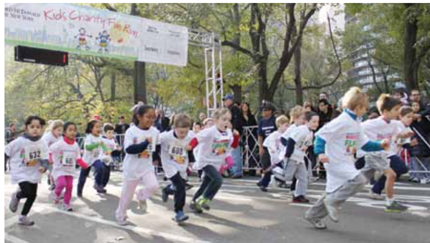
From start to finish, the athletes showed tremendous spirit that day!