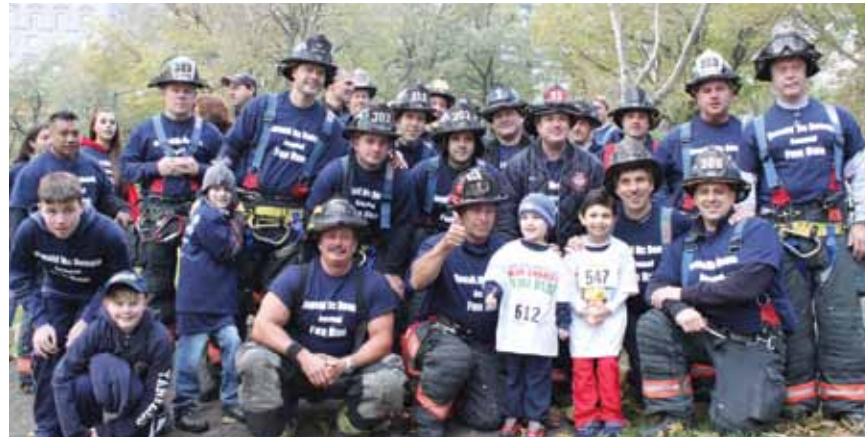
The Yonkers Fire Department helped our little runners every step of the way.