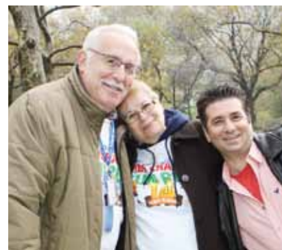
Team Ronald volunteers are always on the scene to lend a helping hand.