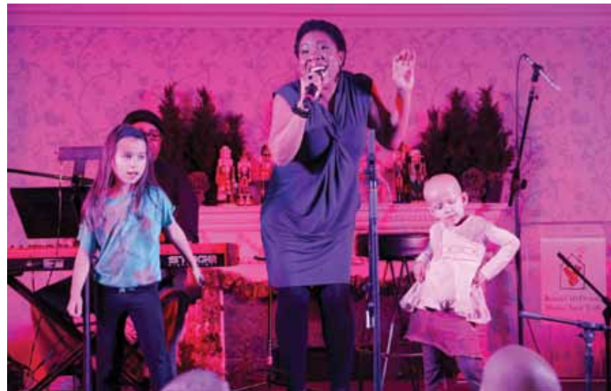
Entertainer Melinda Doolittle getting sassy with a few resident superstars.