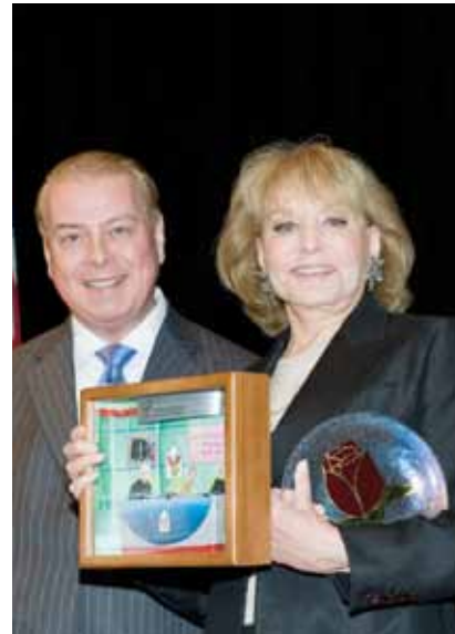
Barbara Walters Presented with RMH-NY Thank You