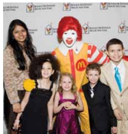
Ronald McDonald with RMH-NY Children