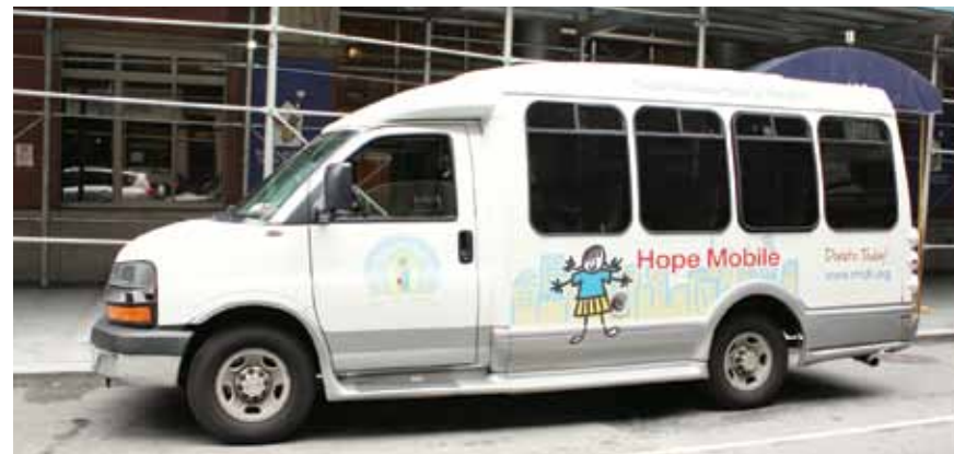
Saying farewell to our faithful "mini-fleet" of transportation vehicles for the families. New custom coaches arrive in August.

They also feature custom-artwork including photos of actual House residents who have stayed with us in recent years.