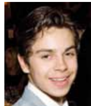
Actor and RMH-NY Youth Ambassador Jake T. Austin