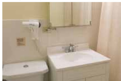
Current guest room and bath before renovation.