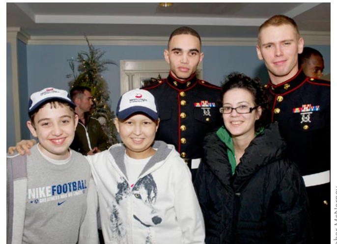
RMH-NY guests with the U.S. Marines.