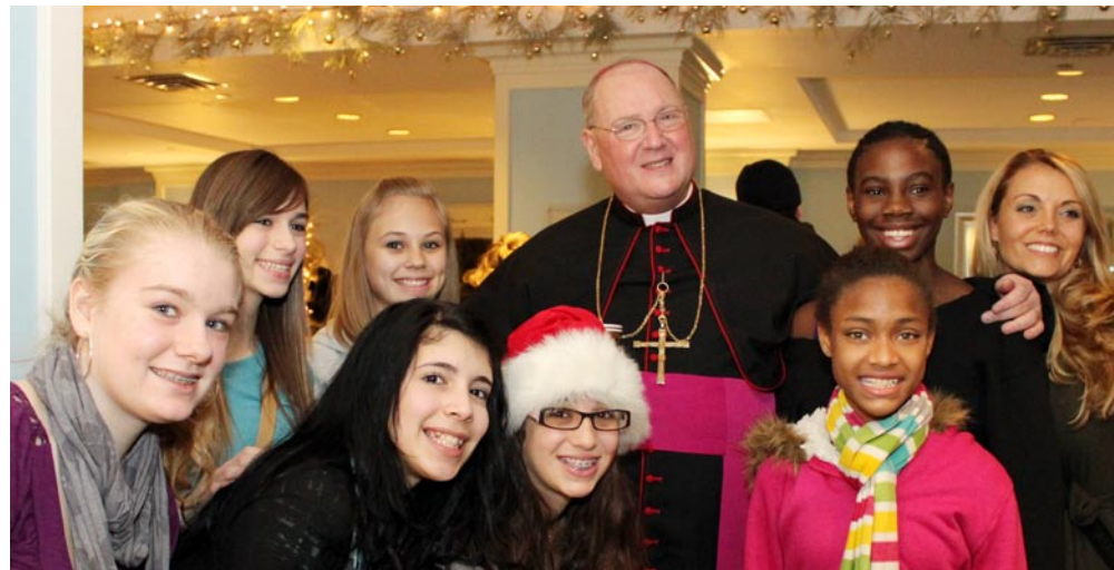
A holiday Toys for Tots celebration thanks to the U.S. Marine Corps and the Army Corp of Engineers.