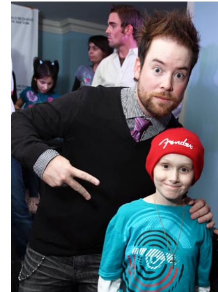
RCA Recording Artist David Cook