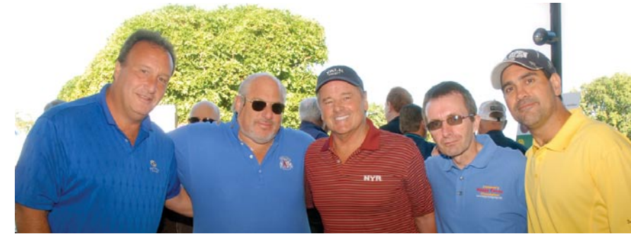
Above: Children's Happy Faces Foundation Committee Members

In addition to Century Management Services, the fundraiser was also supported by a number of notable organizations that included Platinum Sponsor NCB, and Gold Sponsors Efficient Combustion & Cooling Corporation, Hercules Corporation and Mustang Harry's. Morgan Stanley, Hess Corporation, Skanska USA Building, Inc., and the New York Association of Realty Managers also contributed to the day's success.