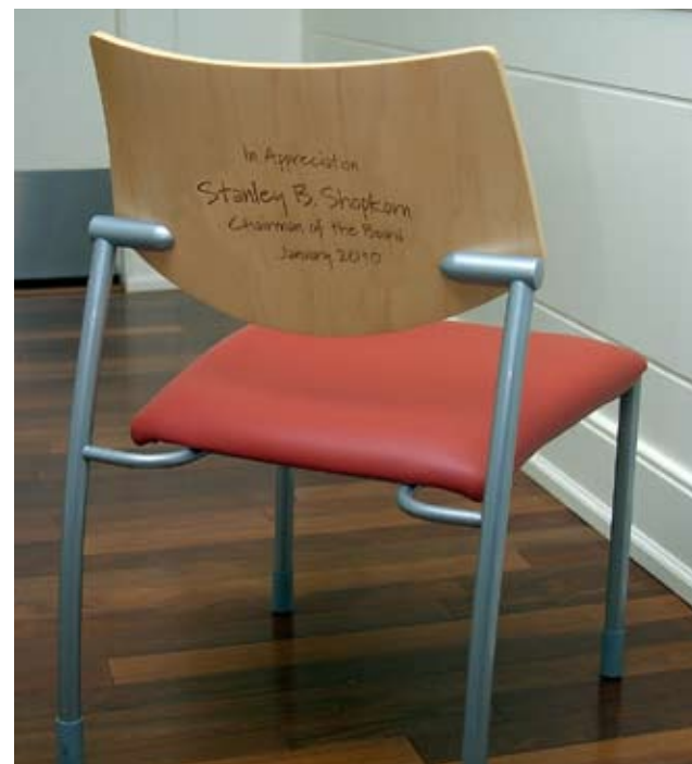
Winter 2010 Around the House Magazine