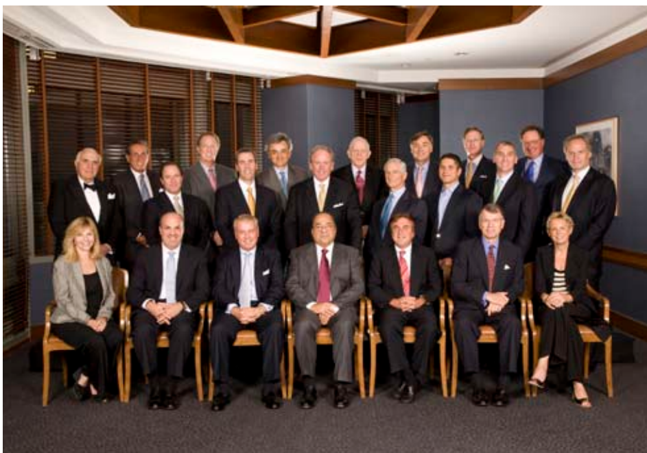
Members of the Ronald McDonald House of New York Board of Directors

..... was to expand in the future to include more childhood diseases that are currently specialties at hospitals far north of the House, one of the questions to be answered is how likely would it be for a family to stay at a location a significant distance from their sick child. Would the availability of rooms designated for families of non-cancer patients make sense if the family cannot live together as a unit in one location? Currently, there is a high demand in northern New York City and The Bronx for non-cancer patients. Some of the non-cancer diseases that could be considered and might benefit from a possible future expansion of the House's current mission include heart and liver transplants, cranial reconstruction, neurosurgery, aneurisms, vascular trauma and epilepsy. But even under the current mission, with progress being made in treatments such as that for Neuroblastoma, it may be likely that other innovative cancer treatments and clinical trials would make up for the gap. At the moment, growth in the cancer population, though arguable, appears to be stable. Treatments are better, more often given locally and treatment time has become shorter, thus affecting patient volume, which currently drives the demand for rooms at the House.