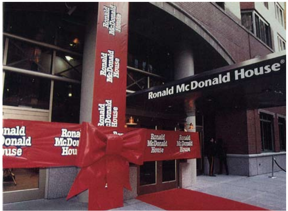
Opening day at our current location on East 73rd Street

As it stands now, the well of possibilities for the future of the House is vast and deep and though more research is needed, the House will continue to address the needs of its community, both now and in the years ahead. The "Wish List" of possibilities seems to grow each day so that as many children as possible can be served and impacted. The list includes the prospect of building family rooms within the children's wards at the