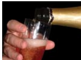
What Makes The Gala So "Gala"?