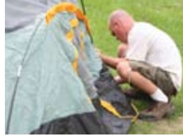
Camp Ronald McDonald, Our Newest Dream