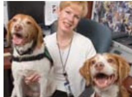
Therapy Dogs: Why We Love These Canine Caregivers